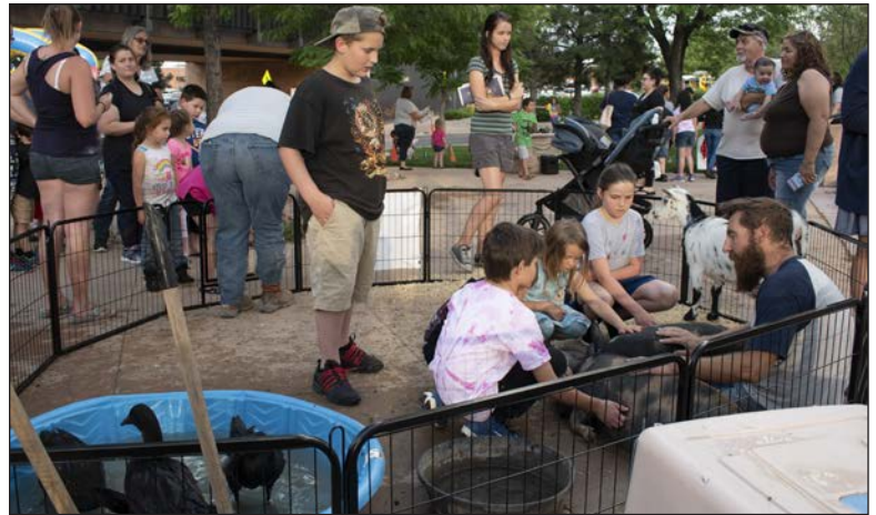
Children attend the FARMily petting zoo at the Summer Reading kickoff at Rawlings.

Nine libraries in Colorado received a star award. San Miguel Library in Telluride and La Veta Regional Library District were awarded five stars, Arapahoe Library District received four stars, and Douglas County Libraries, Mancos Library District,