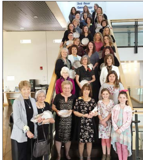
2019 Outstanding Women Awards honorees.