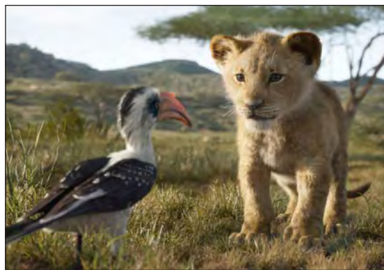
The Lion King (PG)