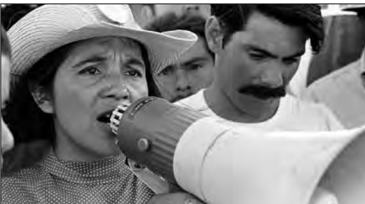
United Farm Workers leader Dolores Huerta (left) in an undated photo.

This event is in partnership with El Pueblo History Museum.