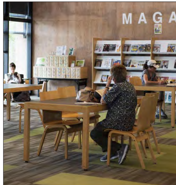
PCCLD will continue to provide Pueblo County residents programs in support of lifelong learning.

Starting right away are two initiatives of interest. First, PCCLD will increase its investment in more new books on the shelves for readers. Our collection development librarians will increase spending on new books in 2020 by almost $185,000 over 2019. This means more books on the shelves of our libraries for you and others to peruse, checkout and read. Second, 2020 will mark the beginning of a ten year plan to refurbish our libraries on a rotating basis to make certain each remains up-to-date, fresh, and inviting for you and all other library visitors. A document outlining the library building refreshes is available online at https://www.pueblolibrary.org/sites/default/files/pdf/PCCLDLibraryFacilitiesMasterVisionPlans.pdf .