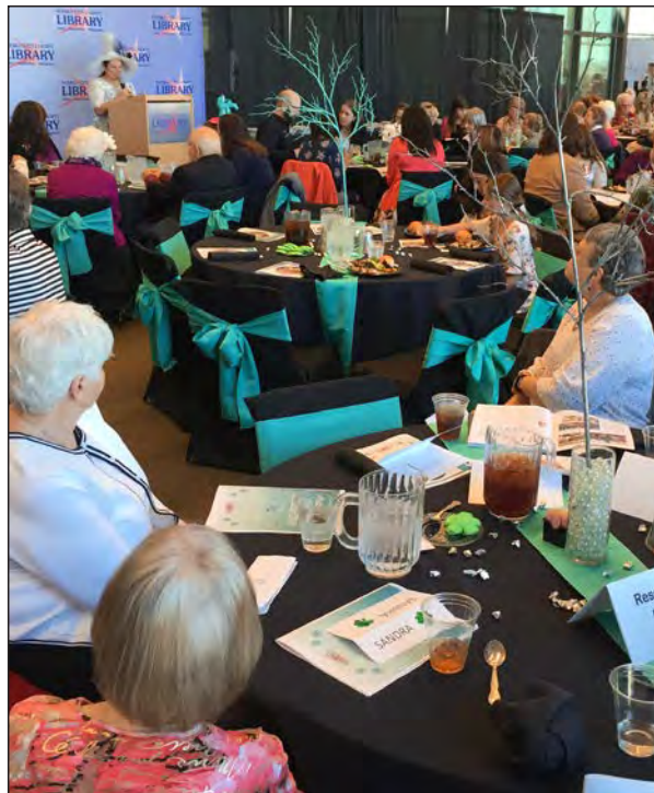
Outstanding Women Awards luncheon at Rawlings Library.

For more information visit pueblolibrary.org/outstandingwomen or contact Sara Schwartz at sara.schwartz@pueblolibrary.org or (719) 553-0220.