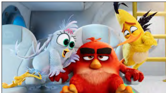
The Angry Birds Movie 2 (PG)

Jan 25, 26: Dora and The Lost City of Gold (PG)