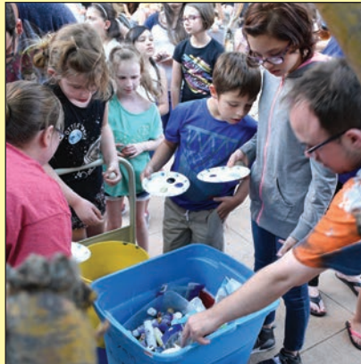
Rock painting with Pueblo Rocks!

All ages. Bring the whole family for a night of fun! Enjoy live music from local band Bad Habitz, rock painting with Pueblo Rocks!, activities for all, complimentary appetizers and drinks and more!