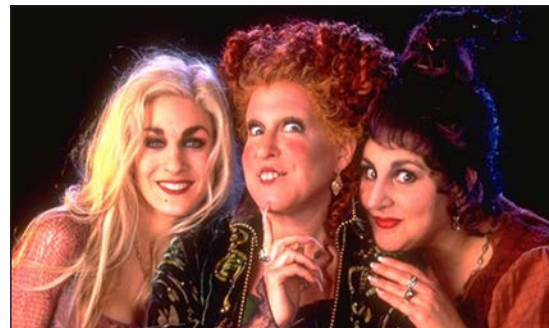
Hocus Pocus (PG)

Filled with jealousy, the evil witch Maleficent curses Princess Aurora to die on her 16th birthday. Thanks to Aurora's guardian fairies, she only falls into a deep sleep that can be ended with a kiss from her betrothed, Prince Phillip.