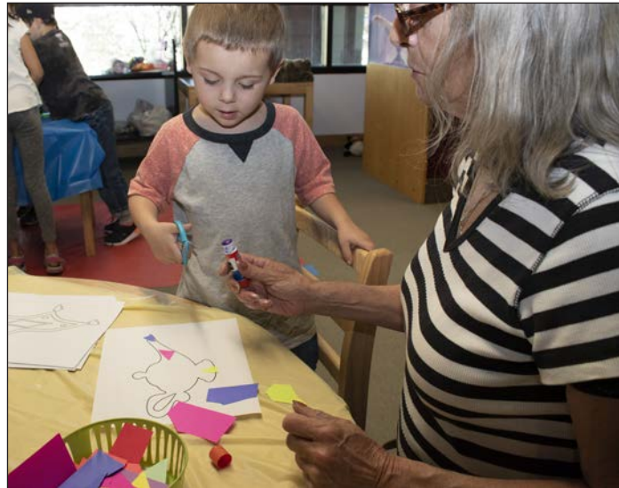
Above: An Aladdin party goer shows off his festive fez made during the Aladdin Party at Rawlings. Right: Making a magic lamp mosaic.