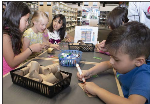
Aladdin Party: Making bejeweled bracelets.