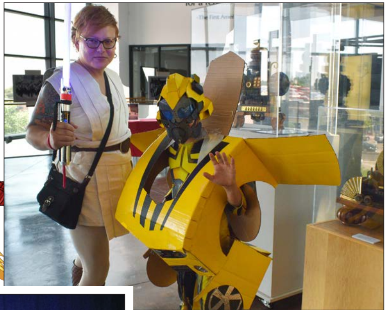
Be transformed at this year's Idea Con, just like these two at 2018's event.