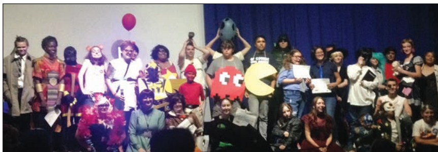
2018's Cosplay Contest participants.