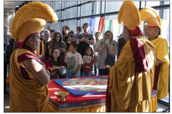
Tibetan Buddhist monks with the Ngari Institute for Buddhist Dialectics, located in far northern India perform a ceremony at the completion of their Tara sand mandala during All Pueblo Reads in 2018.

libraries are a gathering place open at no charge to provide wonderful public space dedicated to learning, study, and free Internet service. Our libraries provide the newest, best-selling and classic books and movies available free to the public. Our libraries are the single institution where open access to information is supported and provided for all. Our libraries are for everyone who want to learn, all ages and all socio-economic circumstances. It is no wonder that our libraries are ranked number one in America and serve as a source of community pride.