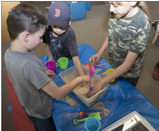
Aladdin Party: Digging for buried treasure