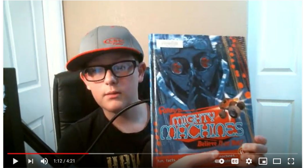
Pueblo's Million Dollar Reading Challenge: Reading Pays Submission