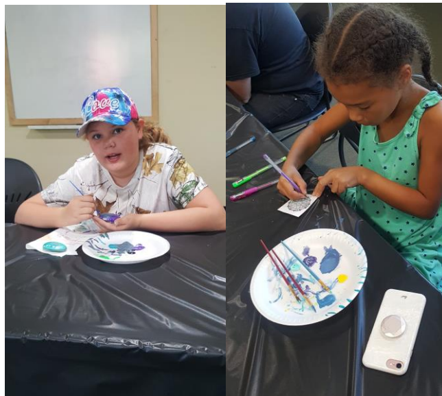
Young patrons at Positivity Rocks