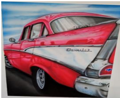
The Art of Airbrushing