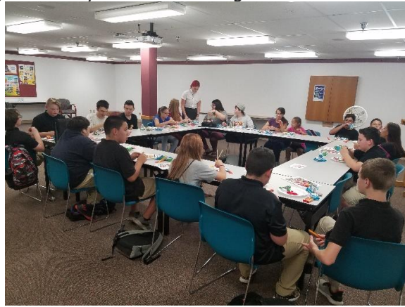
Teens: Candy Sushi