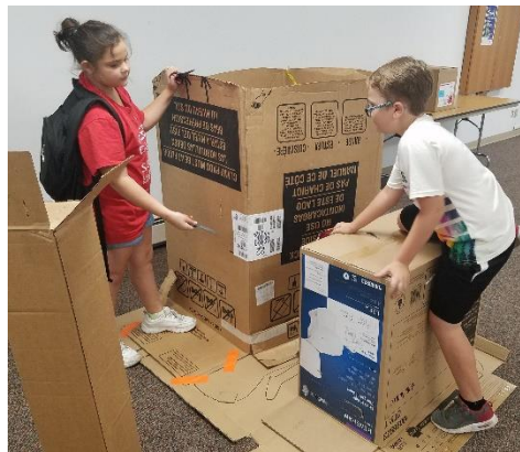
Tweens: Cardboard Creations