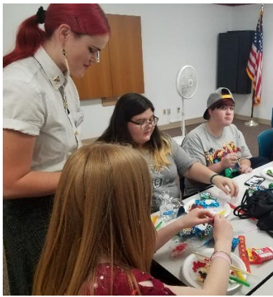
Teens: Candy Sushi