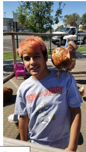
Fun Fridays Petting Zoo Program Packard Grant