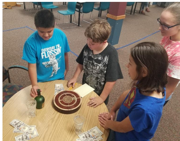
SOCO Escape Room: The Vault