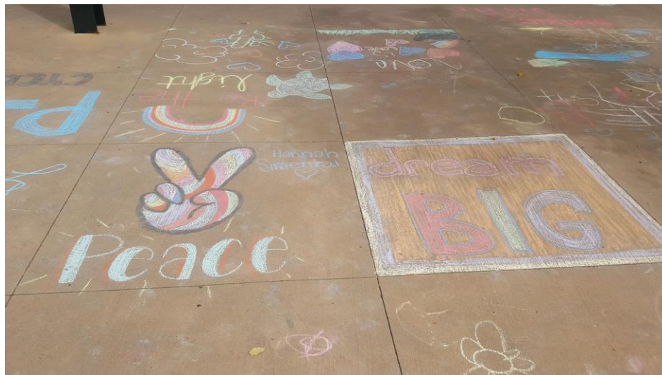
Youth expressed their optimism and positivity at the Chalk Walk.