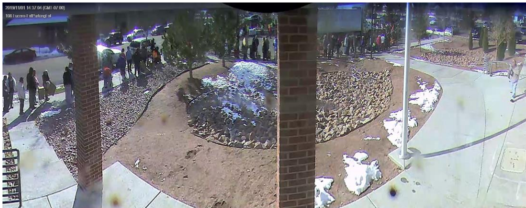
Care and Share Food Distribution