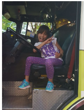
At the Rawlings Summer Reading kickoff.