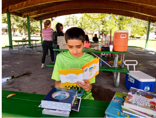
When you find a good book - you can't even look up for a photo.