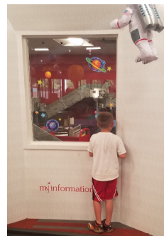
Curiosity: Watching books ride the AMH (automatic material handler)