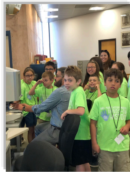
Students from the El Pueblo History Museum visit the SCMS Department.