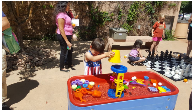
Some family fun in the courtyard.