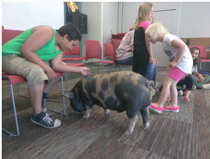
Piglet Power at Giodone.