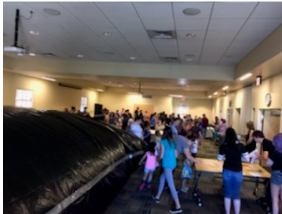
The Pueblo West Kickoff featured an indoor planetarium!