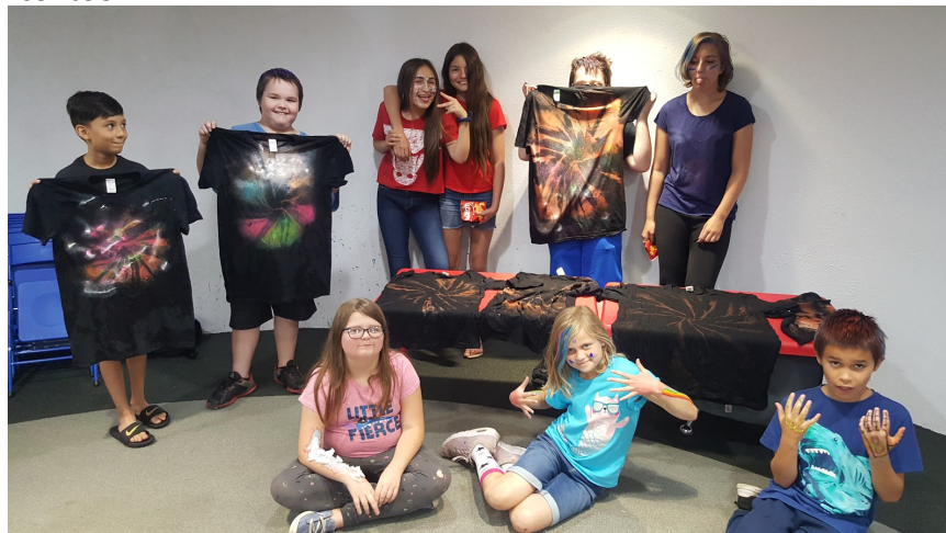
Rawlings tweens show off their galaxy crafts.