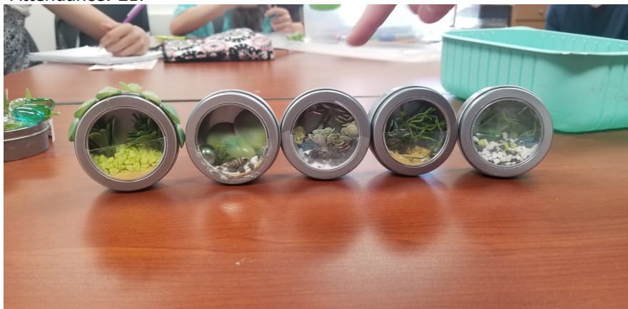
Teen Mini Magnet Terrariums at Barkman.