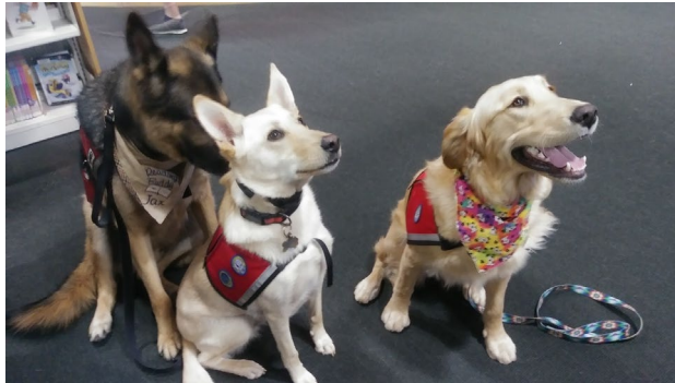
The good boys and girls of the Rawlings Read Dog team.