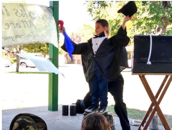
Comedy magic at Bessemer Park.