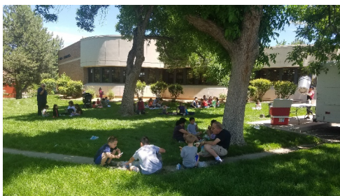
Summer Lunch Program @ Lamb