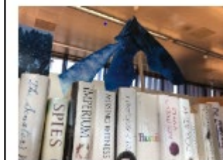
The Wall: Game of Thrones display