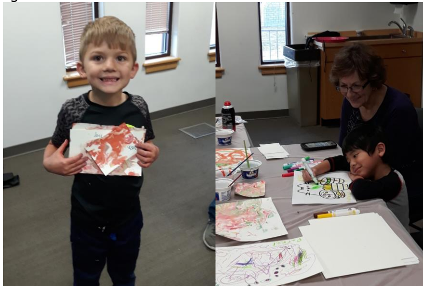
A proud painter and a dreamy drawer at Barkman's Messy Art program.