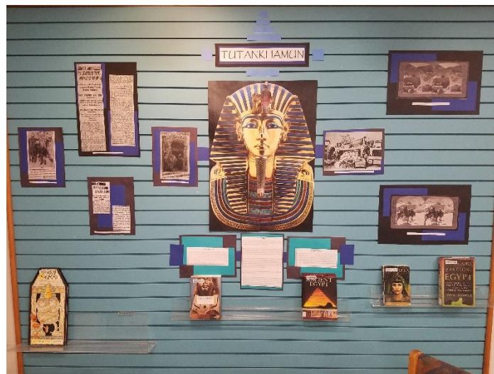
King Tutankhamun Wall Exhibit