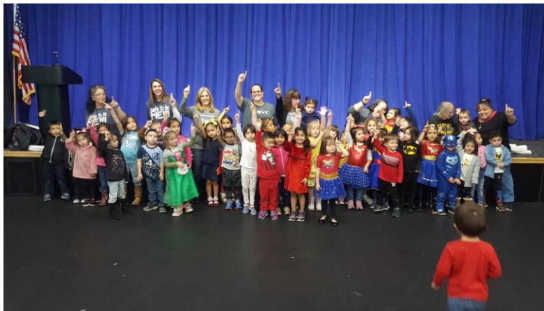
Bradford students are #1! Bradford visited the library on January 23rd and enjoyed storytime and crafts.