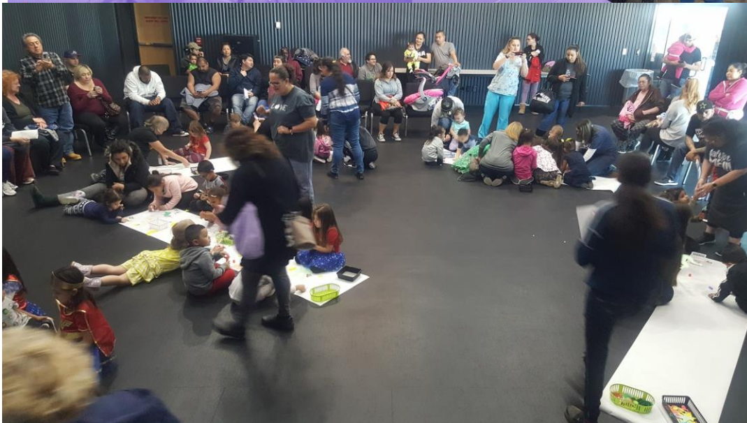
Bradford students took over the InfoZone for their school visit.