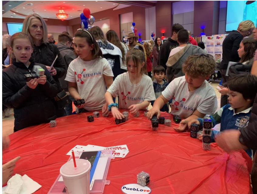
STEM Fair participants experiment with Cubelets.