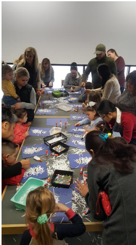
St. Therese students and parents make "snowmen" at a library visit.