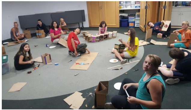
Cardboard Creations at Rawlings.