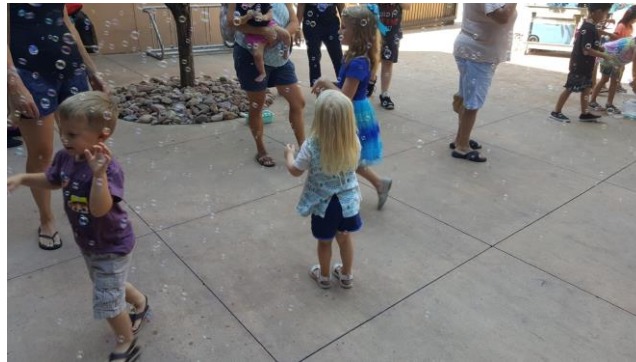
Experiencing bubbles at the Rawlings Family Storytime.