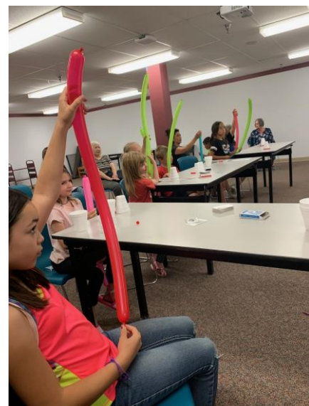
Participants hold their balloons at the ready at the Magic Workshop.