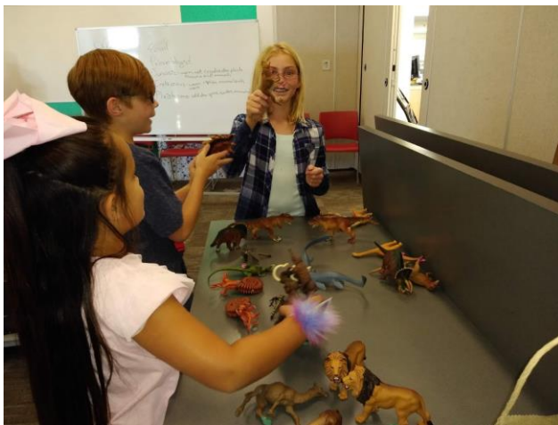
Prehistoric animals come to life at Lost Worlds of Colorado.