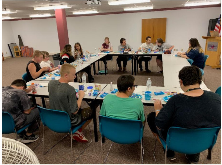
SRP Teen Hangout: Space Food