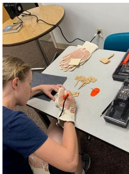
Adult Wood burning Garden Markers