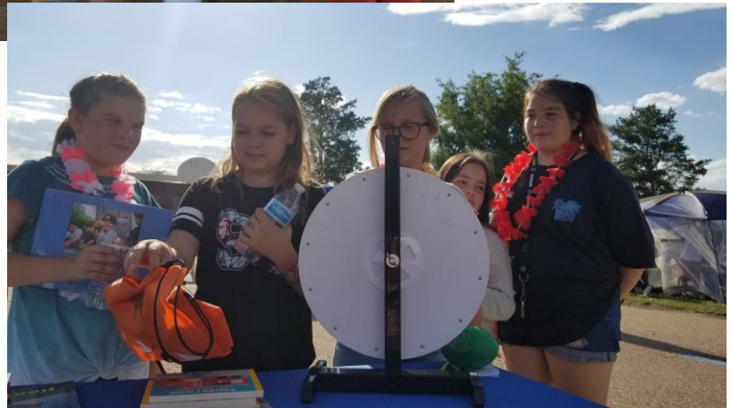
Spin the wheel at the RMSER block party