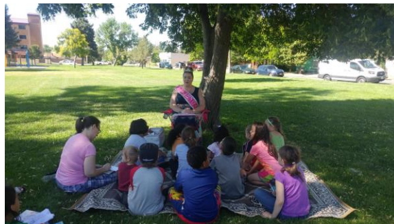
A princess made an appearance at Bessemer Park this month.