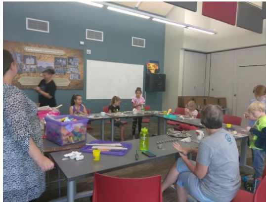
Playing with Clay at Giodone.