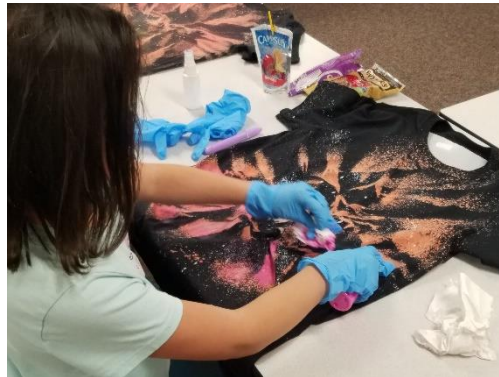
SRP Tween Hangout: Galaxy Swag