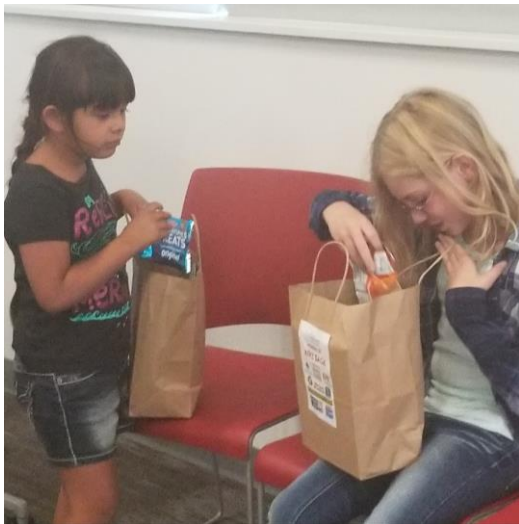
Kidz sacks from Cooperative Care