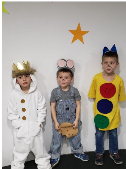
Max, the Mouse and Pete the Cat showed up for the Rawlings Storybook Character Party.