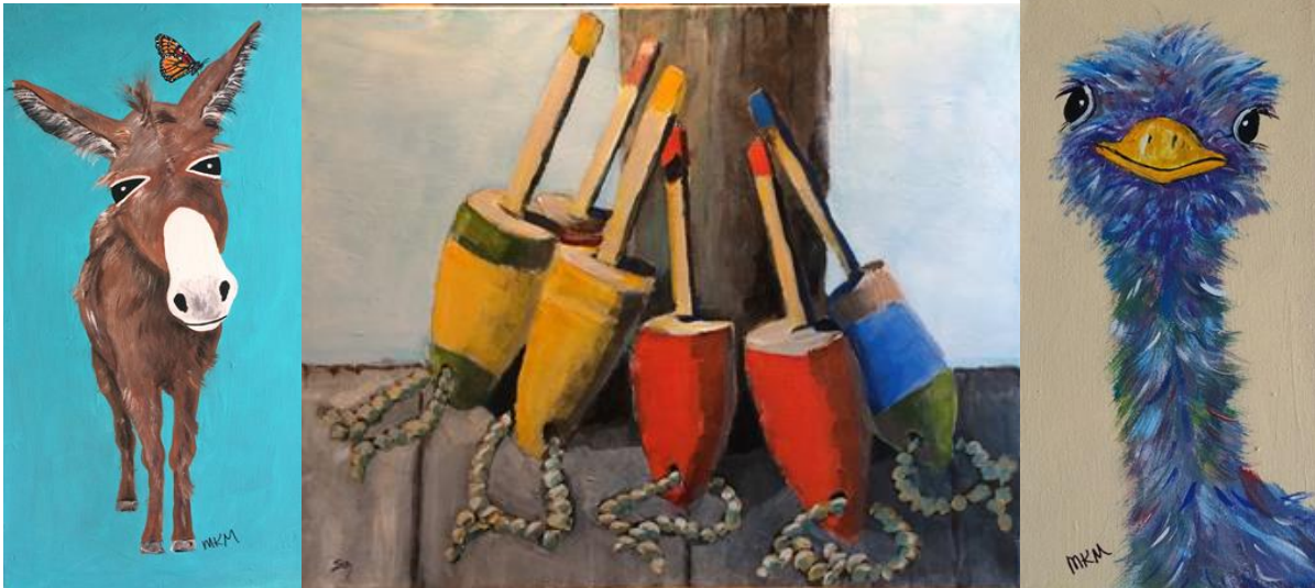
"A Woman's Love of Animals" and "Sketchy"