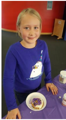
A girl shows off her sparkly and delicious creation at Valentine's Day Fun.

YS-Sponsored Program Attendance - year over year: