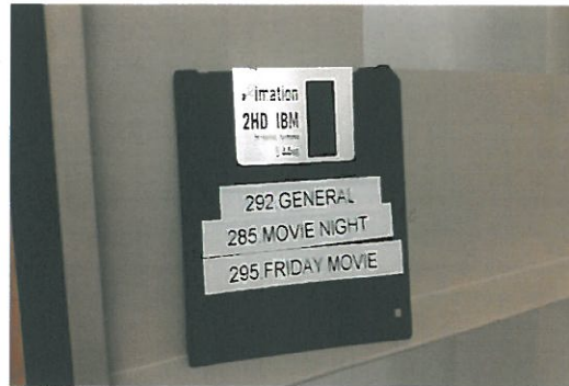
Currently using old unreliable technology

The cost of replacing lighting control system was $47,608.70