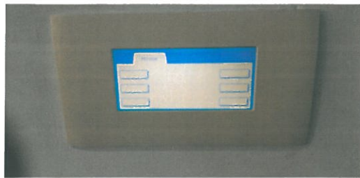
LCD display touch screen 4 total