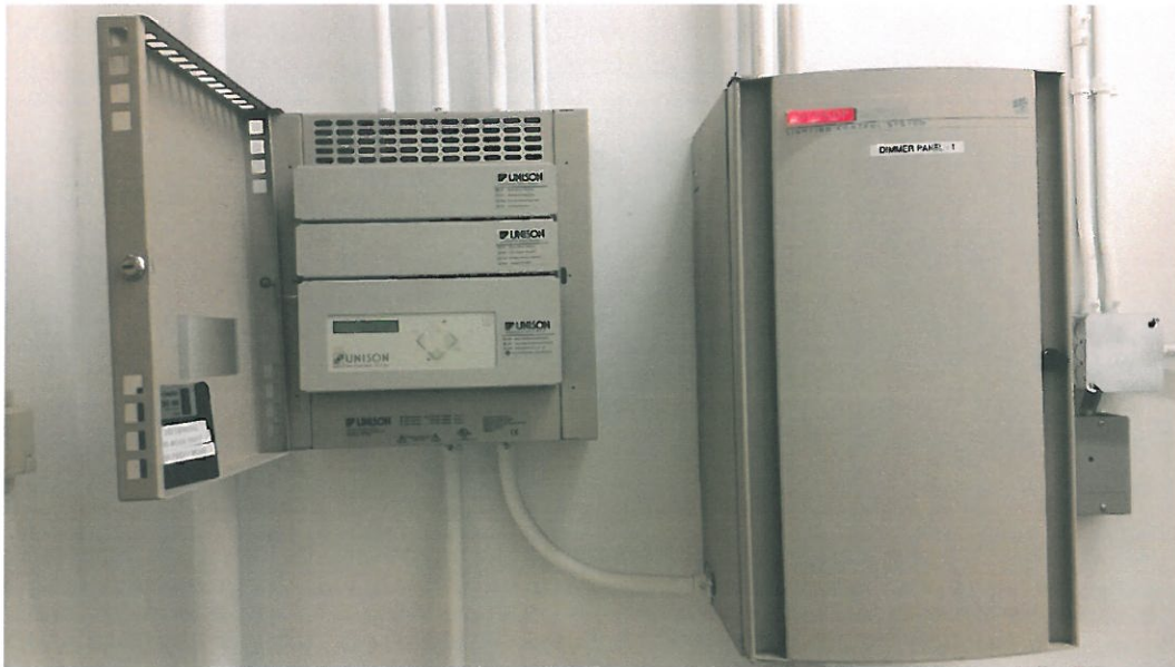
MAIN CONTROLLER AND SECONDARYCONTROLLER