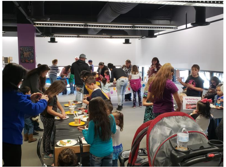
A large, happy crowd at the Rawlings Wreck-It Ralph party.