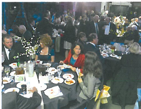
2013 Booklovers Blacktie Ball

The following day, the public event featuring Kathryn Stockett's presentation and a book signing attracted 300, up from 73 attendees in 2013.