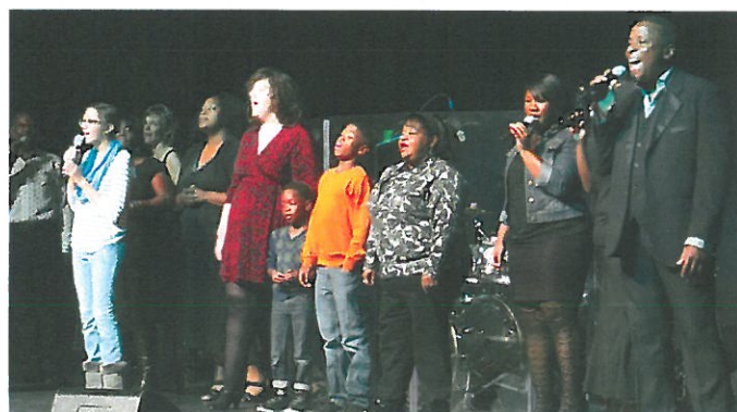
All Pueblo Sings: Expressions of the Soul