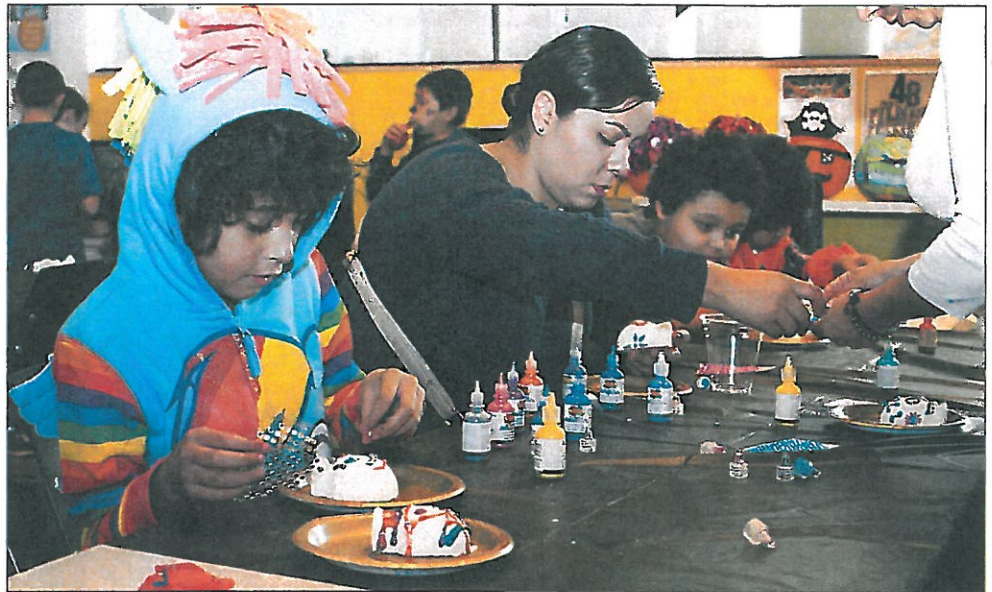
Kids and adults take part in the sugar skull craft during the Dia de los Muertos Festival in November at Rawlings Library.

If every library card holder gave a small amount,