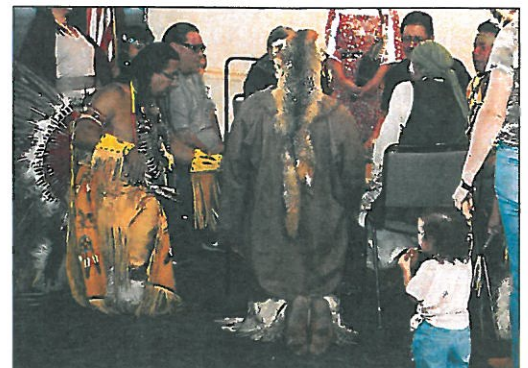
Native American dancers and musicians drum together at Rawlings Library during October's All Pueblo Reads.