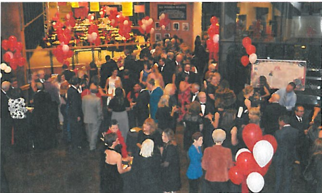
2016 Booklovers Blacktie Ball

The ball had its second highest attendance ever, 217. Ticket sales were $15,150, sponsorships were $18,550, silent auction proceeds were $3,788 and additional donations were $250.