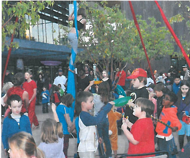
Family Circus Festival and Fun

To expand last year's effort to get kids reading, more than 1,200 free copies of Out of the Dust were given to local students. New for this year was the addition of the companion book author. More than 650 attended three presentations by Karen Hesse. Also new this year was the deliberate focus on family programming. The most successful APR event ever (outside of the public author events) was the Family Circus Festival and Fun, which had 400 in attendance. The philosophical approach to this year's programming was to have less events, but more attendees per event.