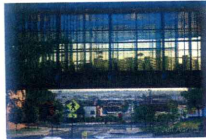
Library Robert Hoag Rawlings Public Library in Pueblo, CO

Whether you're part of the budget, not-buy crowd or just appreciate the perks of a fine library, the Robert Hoag Rawlings Public Library in Pueblo will please you. Interactive features like the InfoZone News Museum, and separate sections for children and teens, set this library apart from the crowd. If you'd rather browse a bookstore, Pueblo and its surrounding areas have plenty of those as well. Forty-four to be exact, including nearby Colorado Springs' Poor Richard's , a restaurant, wine shop, toy and bookstore in one.