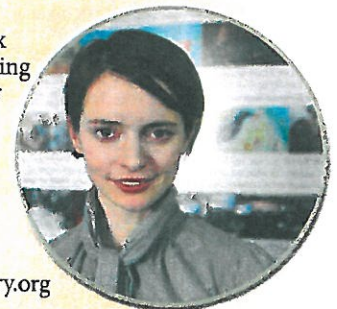
Emily St. John Mandel

Emily St. John Mandel will talk to CSU-Pueblo students and local high school students.