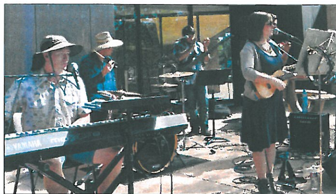
Members of Friberg Friday will perform as The Flock at the kickoff.

multimedia components encouraging new perspectives about engineers and their vital work. See page 12 for details.