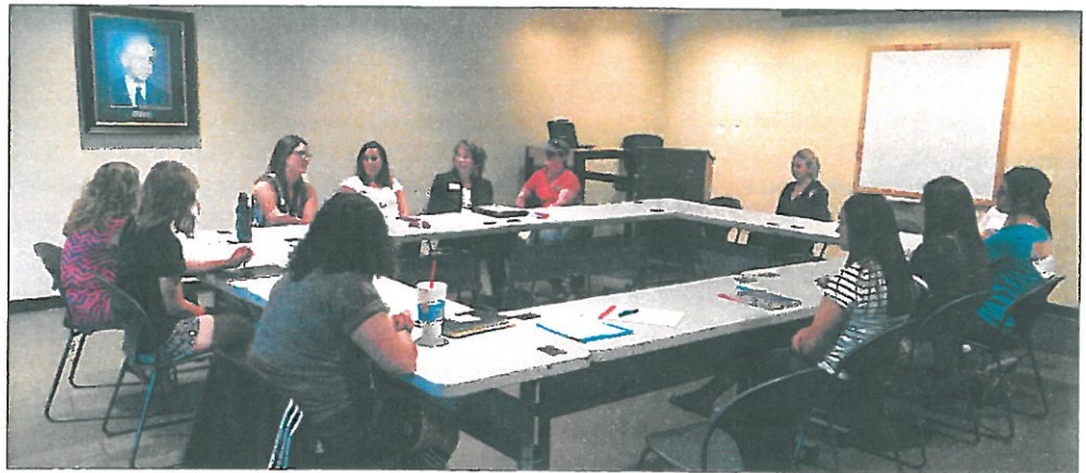
The 2016 Leadership Institute class listens to women leaders in the community.

The six-month institute culminates with Le Bal de Bibliotheque on Saturday, July 15, a one-of-a-kind event where all participants will be publicly recognized for their accomplishments and presented to the community.