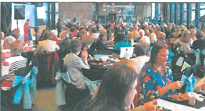
The second floor of Rawlings is transformed for the Outstanding Women Awards.

Luncheon/awards ceremony: Friday, March 10, noon, RA, 2 nd floor Nominations due by Friday, Feb. 10