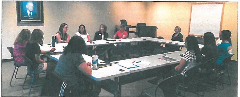
The 2016 Leadership Institute class listens to women leaders in the community.

The six-month institute culminates with Le Bal de Bibliotheque, a one-of-a-kind event where all participants will be publicly recognized for their accomplishments and presented to the community.