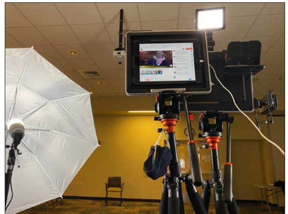
Padcasters are used to livestream the All Pueblo Reads author talk.

of the branches within the district have their own Padcaster and accompanying