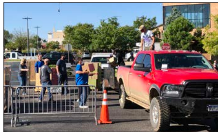
Nearly 800 veterans and their families from throughout southeastern Colorado were aided during the Veterans Food Distribution sponsored by The Center for American Values and hosted by PCCLD.

Both events featuring the APR authors were livestreamed on the district's Facebook and YouTube pages. Both authors spoke to students in Pueblo School District 60 and Pueblo County