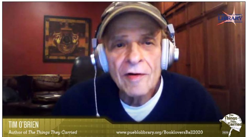
NEA Big Read All Pueblo Reads author Tim O'Brien delivered his Booklovers Ball presentation from his home in Austin, Texas.

School District 70. O'Brien wrapped up All Pueblo Reads with a livestreamed public author talk on November 6.