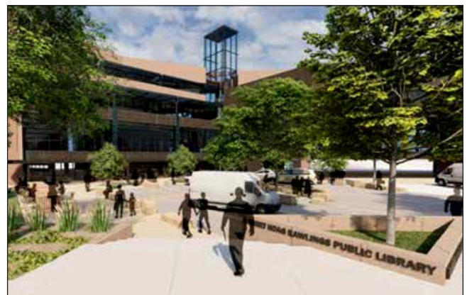
Architectural rendering of the renovated entrance to Rawlings Library

into the future. A few of the improvements that will take place include an expanded youth services area, creation of a mobility plaza to create better access to the building, and an increased fourth floor event space.