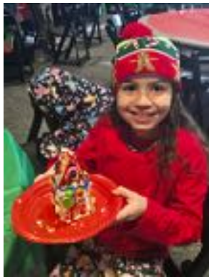
Next a young girl holding her gingerbread creation.