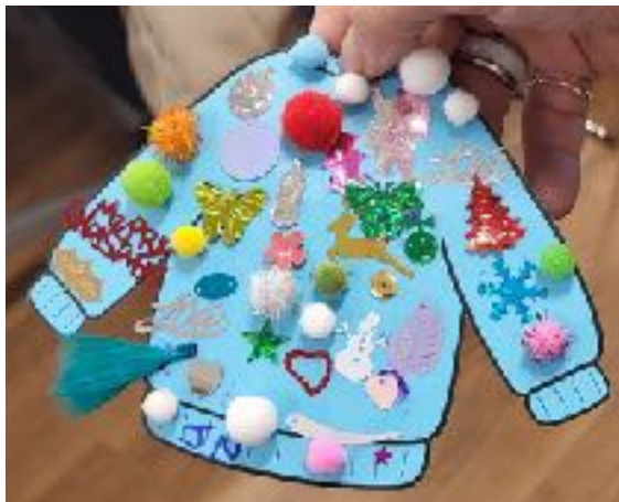
An ugly sweater paper craft covered in decoration and sparkles.

Barkman staff prepped and provided multiple Holiday Programs during the unusually warm month of December. Our Jordan Residential group has grown from 30 attendees to between 40-60. It's a big squish getting them all together now, but they still have a great deal of fun! December's craft and challenge was to wear your ugliest Christmas sweater. The craft, was also, making your own ugly Christmas sweater. Sadly, no one showed up in an ugly Christmas sweater to show off.