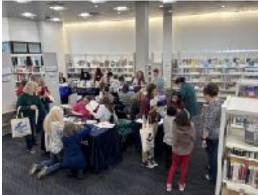
A large, open library space with white walls, high ceilings, and tall bookshelves filled with books.