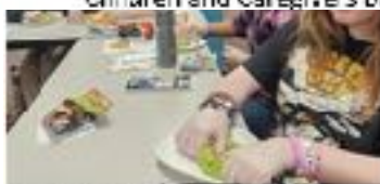
Teens/Tweens creating no-bake treats!

themed family matinee, where we screened a Muppet's Christmas Carol, and attendees received popcorn, hot chocolate, and a goodie bag!