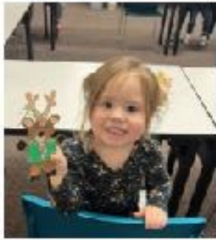
Child enjoying preschool story time crafts!

Button Wreaths - Our senior craft ladies brought creativity and cheer to the table while making beautiful button wreaths! With colorful buttons, thoughtful designs, and lots of laughter, each wreath became a unique work of art. It was a joyful gathering filled with creativity, conversation, and plenty of holiday spirit!