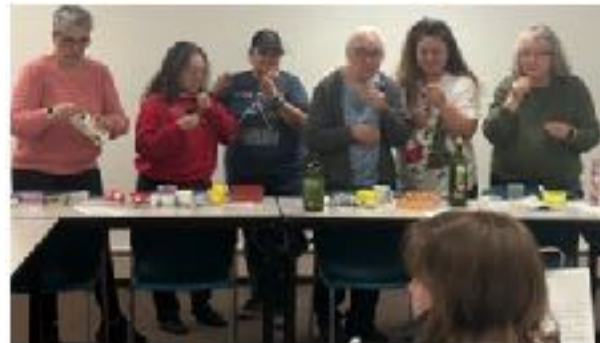
Dedicated crafters enjoying senior craft!

members, while El Centro de Quinto Sol supported the program by providing gifts for children to open. The event included a festive opportunity for families to take photos with Santa, which was especially popular among attendees.