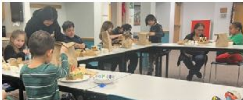
Children and Caregivers building gingerbread houses!

Fun Friday included a centralized program for gingerbread houses and a holiday