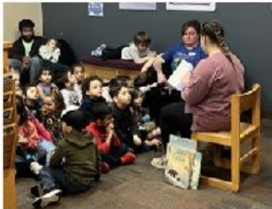
Storytime at the Y!

Storytime @ the Y: Holiday Spirit and Reindeer Reads - This month, the kiddos showed enthusiasm and excitement for the themes with the upcoming holidays, and of course, couldn't resist sharing their Christmas Wish lists!