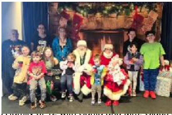
A family of 12 with Santa and Mrs. Claus getting their picture taken.