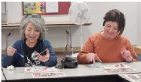
Making button wreaths in senior craft!