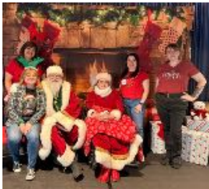
A picture of the Youth Services team with Santa.

This year's Holiday Bash, included gingerbread house making, a hot cocoa bar, and pictures with Santa and his Mrs. The program saw 267 attendees, including many first-time house makers but it also had several that stated this has become a tradition for them.