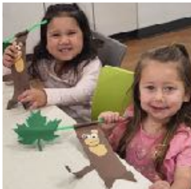
Two little girls grinning and showing off their monkey crafts.