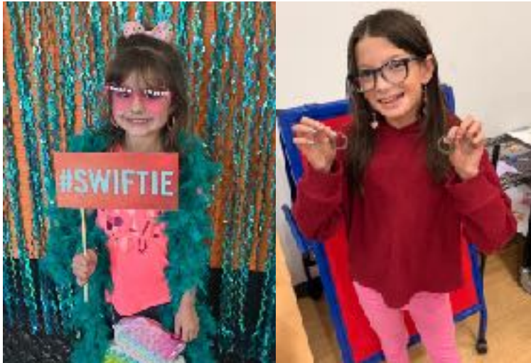
Picture Above: (Left) a young “swiftie” holding up a #swiftie sign at the photo setup. (Right) A young patron showing off new earrings she had just made.

On December 13th, we hosted a Taylor Swift-themed birthday party. The event saw an attendance of 78 guests, ranging from a variety of ages. The program successfully invited participants to "enter their favorite era."