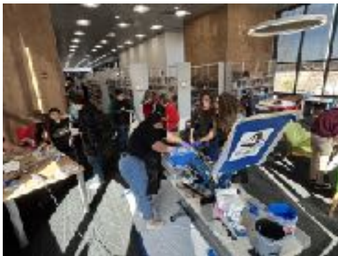
Groups of people of various ages gather in the central aisle participating in activities. Several attendees hold white tote bags printed with the words "Adult Winter of Reading 2026," reflecting a lively community event.