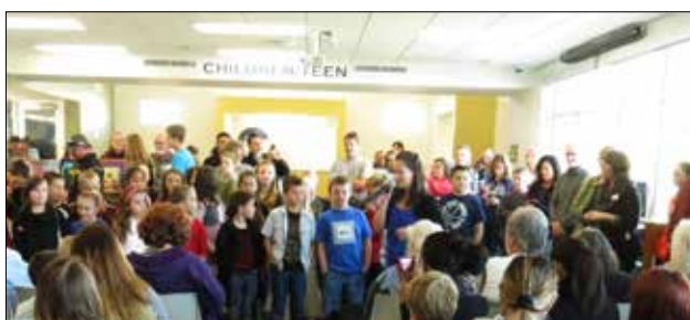
The Rye Elementary School choir performs at the Greenhorn Valley grand opening celebration.

Lucero Library's celebration will take place on December 7. Lucero Library is currently