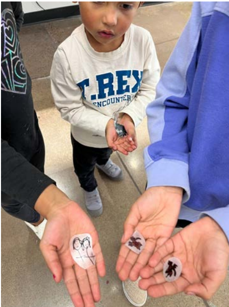
Tweens and a young child holding shrink art made at Tea & Makes+