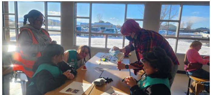
Children with green vests sitting at a table near a window doing crafts.

Each month I bring a new hands-on activity for the girls to work on and they have been loving this experience!