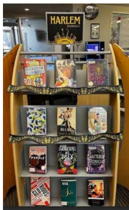
Beautiful display titled, "Harlem Renaissance"