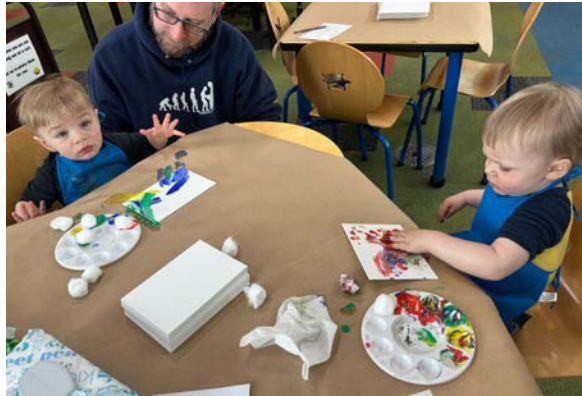
Two toddlers sitting at a table finger painting, their guardian is sitting next to one of them observing their painting.

The toddlers had a messy and fantastic time creating their masterpieces! For a few of the toddlers it was their first ever time painting! They were very intrigued and excited by paints and their caregivers were happy they got this experience at the library!