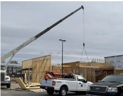
Picture of the crane lifting portions of the new addition walls and ceiling into place.

Here are some site photos from the past week.