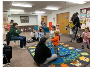
Toddlers and Parents Enjoying Storytime!

Family Storytime and Fun Friday continue to bring in families with several themed stories and crafts, including Rose Day, Valentines, Bird House Making, and Carnival!