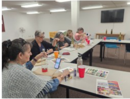
Seniors Participate in Wine Bottle Painting