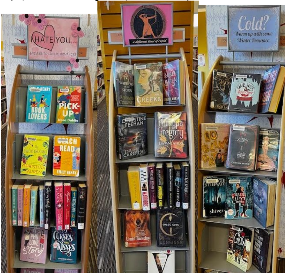
The photo shows three end display bookshelves with various books on them.

Finally, 3 "out of the ordinary" end displays: "I hate you. Enemies to Lovers Romance," A Different Kind of Cupid," and for our Young Adults, "Cold? Warm up with some Winter Romance."