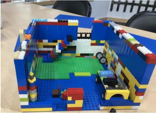
Photo: a house built out of various colorful legos

The weekly Lego Club program continues to see great support from families in the community who use the library's Legos to collaborate with each other on creations.