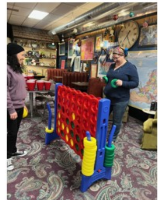
Giant Game Night at The Ethos