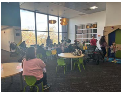
Photo: A crowd of families gathered around to attend the love and friendship program.

In preparation for the Young Child Art Show in March, the library focused on youth programs for children 7 and under about creating art. Children were given the materials to make their own art pieces at 3 different programs in February.