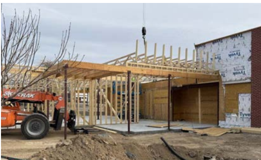
Picture of the new front entrance (facing the Pueblo Community Health Center).