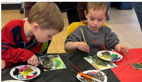
Photo: Two young boys using paint brushes to paint on canvases

In preparation for the Young Child Art Show in March, the library focused on youth programs for children 7 and under about creating art. Children were given the materials to make their own art pieces at 3 different programs in February.