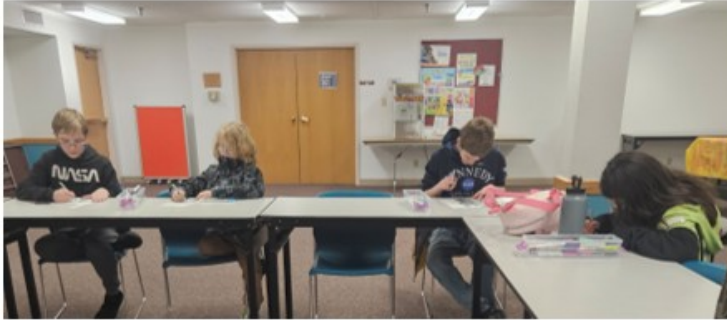
Teens/Tweens Creating Dinky Designs (Shrinkydinks)