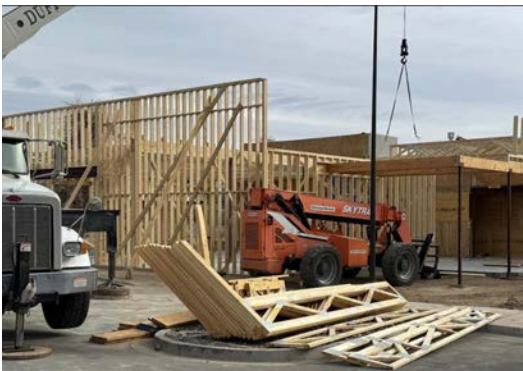
Picture of the walls of the new meeting room addition and the new front entrance to the library.