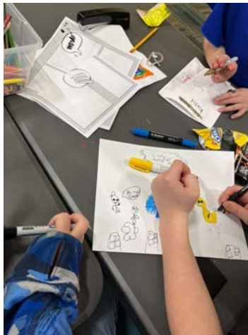
Children drawing with colored markers

The tweens requested to make their own comics and we delivered! They all had a blast creating their own characters and stories. A few of them asked each other to collaborate on each other's comics!