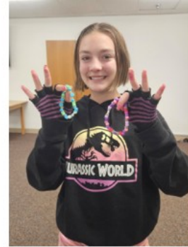
Teen holding Valentines Friendship Bracelets