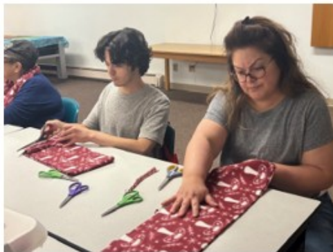
Creating Cozy Fleece Scarves in Adult Craft