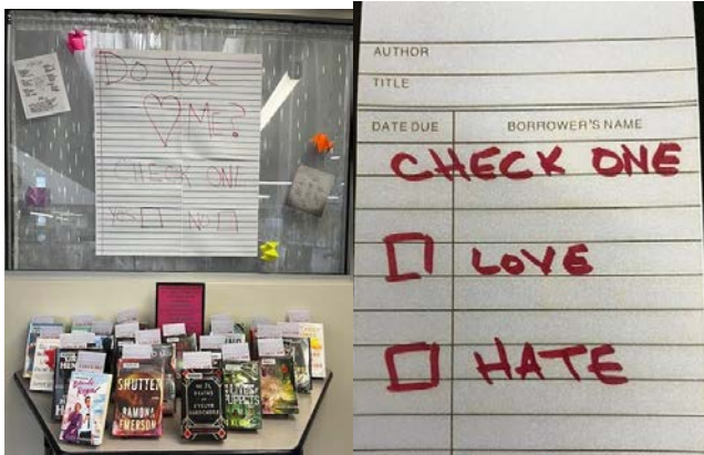
Pictured shows a table of books and above the books is a note that asks, do you love me? There is a card that asks the reader to check a box that says love or hate.

We also highlighted the District's Valentine's Day theme for February. The main display is a very clever take on notes we used to pass to each other – "do you like me? Yes/No." Staff members populated the table with books that we either loved or hated. Patrons could check any book out, then mark the box that tells us if they liked or disliked the book.