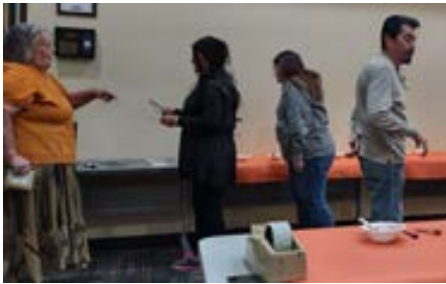
People participating in spice mixing class

The Indian Spice Mixing class on October 25th was fun and very fragrant! Seventeen different spices were available, and attendees could either make their own mixture or choose from six different recipes that were provided, such as garam masala, chai, and tikka masala. Information on the history and cultural importance of these spices was also provided.