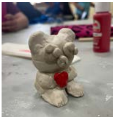
Artober Craft clay bear