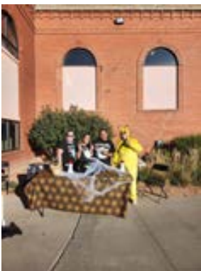
Lucero Team Table at event (Spooky Voices Program, handing out flyers)