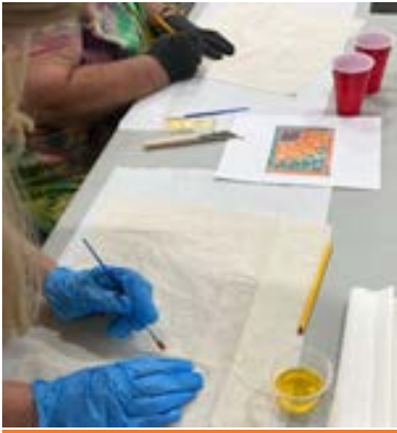
People at a table doing batik printing