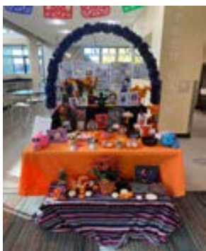
Picture of a community ofrenda.

We had more community participation this year, with some community members even contributing pictures of beloved pets that have passed away. The ofrenda was available to the public starting October 16, and will be taken down on November 3. Some participants from our sugar skull decorating program contributed their finished sugar skulls to the community ofrenda as well.