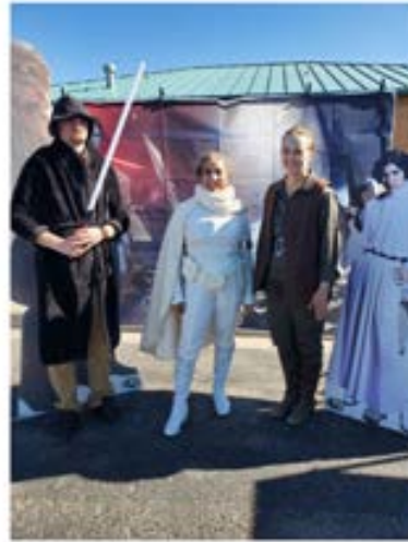
Staff dressed up as Star Wars characters.