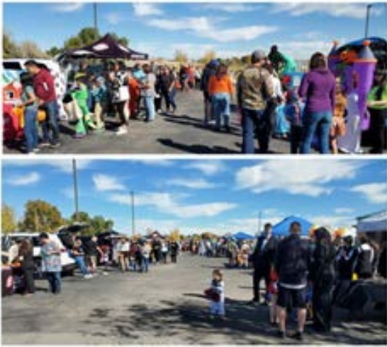
Groups of people attending the trunk-n-treat.

This year PW hosted another successful, community trunk-n-treat with over 600 people in attendance! This year PW Library's theme was Star Wars and we all had fun dressing up as Star Wars characters. The PW community loves this event!