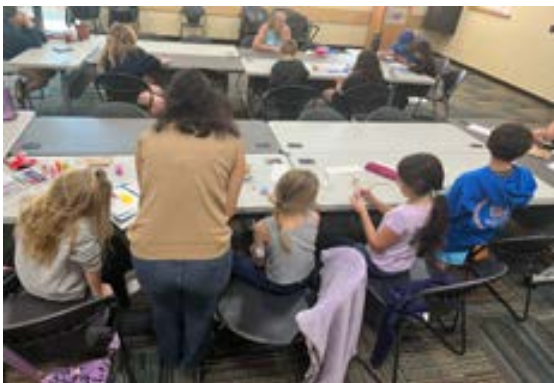
Artober program kids at table

Artober happens every October and is a 31 day art challenge. Youth participate in this program throughout the district and receive a kit2go with art supplies to complete the challenge. At PW we kickoff the program with an art hangout. Youth created art of all varieties with multiple mediums.