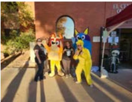
Lucero Team at the trunk or treat event