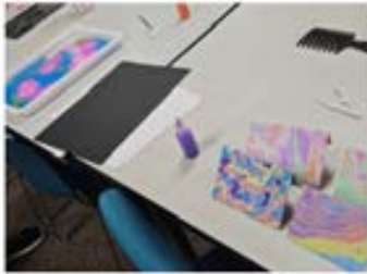
Water Marble Art Cards!

Teen/Tween night is picking up! So happy to report that after some revamping and reevaluating the numbers for teen/tween nights have been increasing steadily and we closed our October with the largest attendee night in several months! Gio has been working really hard making connections and inviting the public to come join us for our teen/tween nights, and with the holidays coming up and more programs planned, I am very optimistic about the success of this program