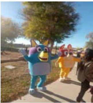
Bluey and Bingo saying hello to all the trunk or treaters (Jerry V "Bluey" and Devon "Bingo")