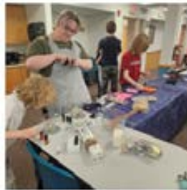
Teen/Tween Spooky Soaps!

Our recent Henna program was a great hit, drawing in enthusiastic participants who enjoyed learning about and experiencing this beautiful art form. The session was engaging, with each person having the chance to receive intricate henna designs and learn about its cultural significance. The response was overwhelmingly positive, with participants expressing excitement about the program and showed just how much our community values unique, hands-on programs like this one.