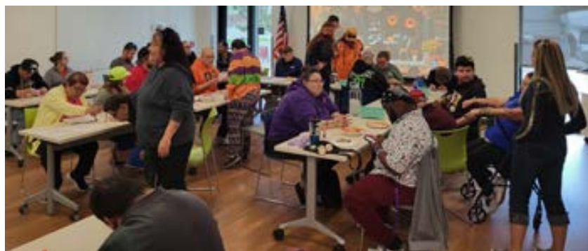
Participants from Jordan Residential taking part of a library led program wreath craft.

Our outreach partner, Jordan Residential, came to the Barkman library for the first time instead of the Barkman team traveling out to meet them. They were very grateful for the extra space that the new meeting room provides and has determined that they will continue to come because it is easier and more convenient for them.