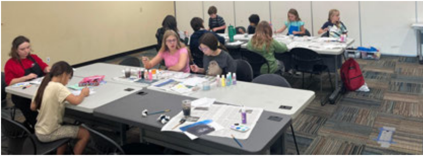
Tween Hangout Painting

Tween Hangout has been very popular the last few months. Especially when we have a craft or art. The Tweens were very excited to be able to use their imagination to create unique paintings.