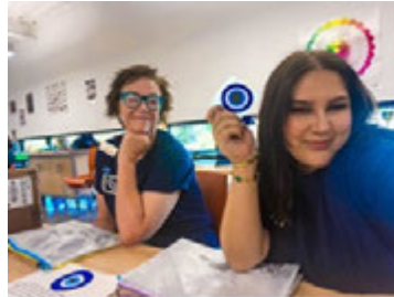
Evil Eyes at the APR Kickoff!