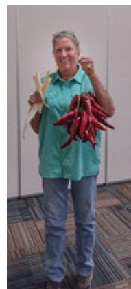
Woman holding chili ristra