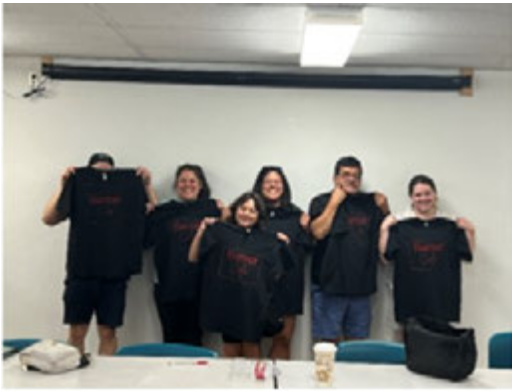
Horror Café Book Club