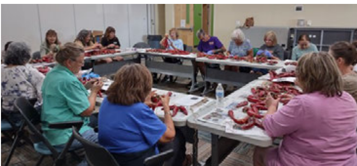
Chili Ristra Class

The Chile Ristra class on September 20th was a huge success! Attendees were able to assemble their own ristras using chiles from local Pueblo farms. While the project was a lot more challenging than anticipated, everyone had lots of fun and was very proud of their creations