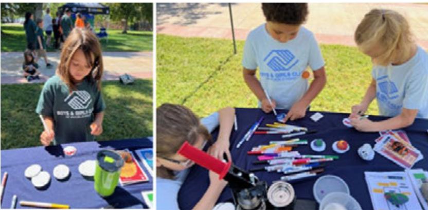
Campapalooza Outreach hosted by the Boys & Girls Club of Pueblo