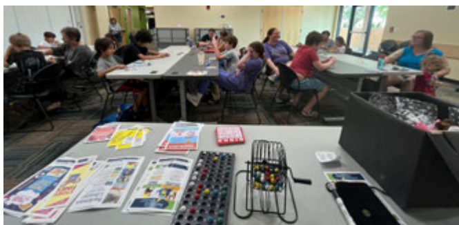
Family Bingo Night

PW had a crowd for the centralized program Family Bingo. The kids were super excited to be able to play and win prizes! It was an exciting program and parents were interested in more Family Bingo in the future.