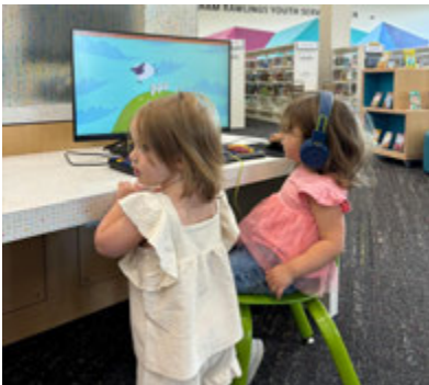
Two 2-year-old girls at a Magic Desktop computer. One child with blond hair wearing white is standing. Brown haired girl with a peach colored shirt is sitting in a green chair with large blue headphones on.