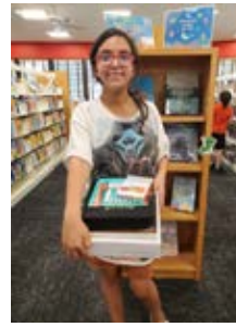
July Grand Prize Winner!