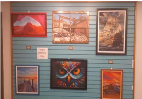
Art by Marshall Wolf - 333 attendees