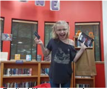
Excited library patron!