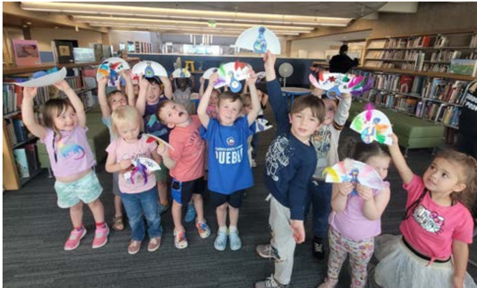
CSUP Daycare poses with their peacock crafts for zoo storytime.

CTLC Learning Center Summer Outreach: 134 Head Start Storytime @ Christ the King: 72 Summer Reading Kickoff: 384 Building Blocks Visit: 32 Morton Elementary School Most Improved Reader Ceremonies: 588