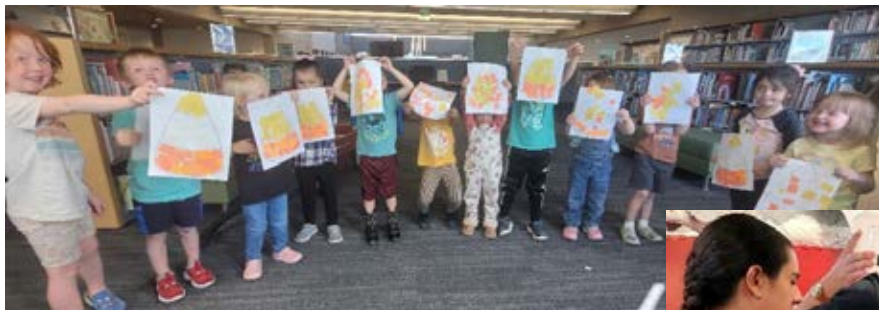
The second CSUP class made some great candy corn creations