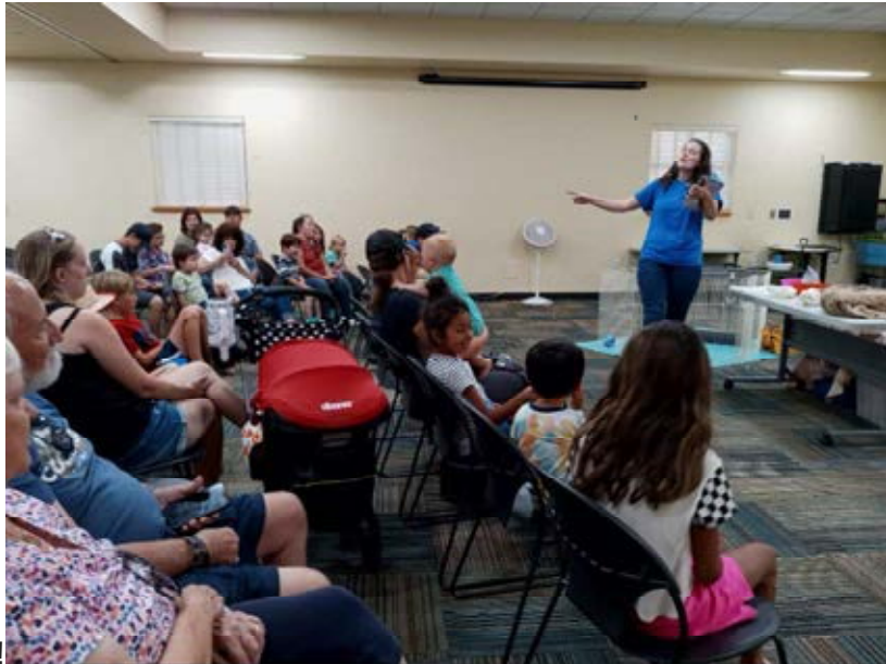
Story time with the Pueblo Zoo!