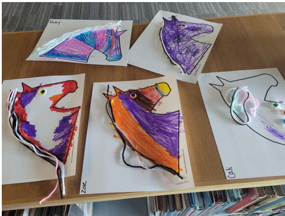
Creative horse heads with the CSUP Daycare