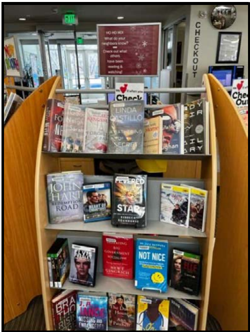
Recently Returned Display