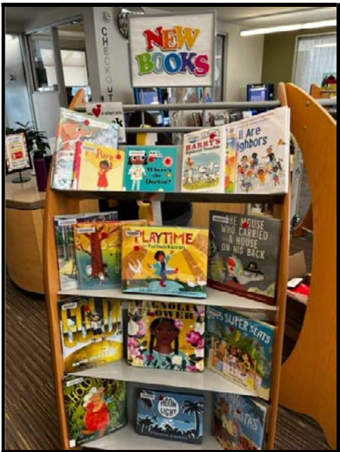
New Picture Books