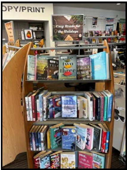
Cozy Reads for Holidays Books