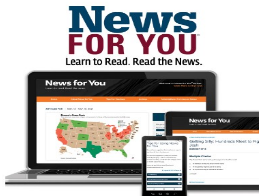
News For You® Online