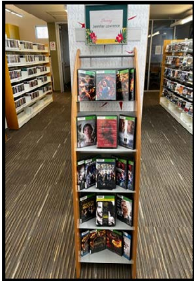
Starring Jennifer Lawrence