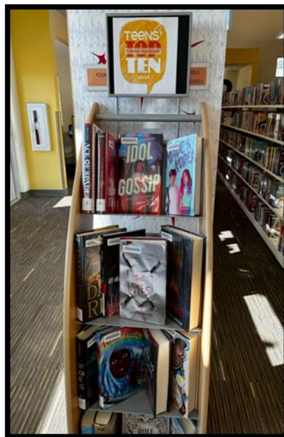
YALSA Top Ten