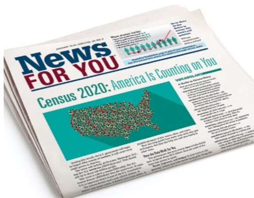
News For You