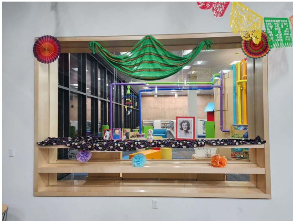
Día de los Muertos altar and program

A couple notable programs offered during November were the Dia de los Muertos program as well as a storytime offered to Minnequa students.