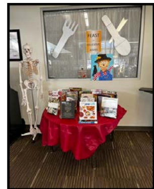
Feast on Delicious Books