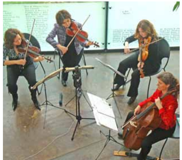
The Veronika String Quartet performs at the All Pueblo Reads Kickoff.

The InfoZone News Museum hosted Torn From Home: My Life as a Refugee , a traveling exhibit created by the Lied Discovery Children's Museum of Las Vegas. More than 11,600 visitors were taken on a hands-on journey into the lives of millions of children forced to flee their homes in conflict regions throughout the world.