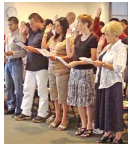
New Americans are sworn in at a citizenship ceremony held at the Rawlings Library in August 2009.