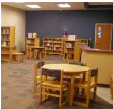
The newly opened Library @ the Y.