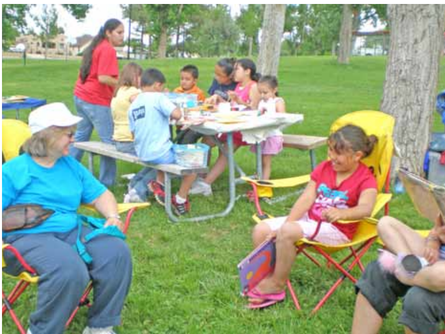
People gather at Mitchell Park for a Books in the Park outdoor-library program.