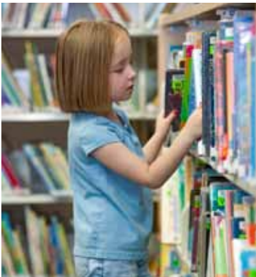
A child browses the shelves at Pueblo West Library.

The Library @ the Y opened in late 2009. It is a 1,000 square foot library housed at the new YMCA facility.