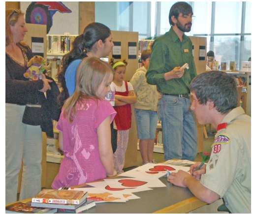
Satellite Saturday for the mountain school in January 2008.

Satellite Libraries: Avondale Elementary School 213 Hwy. 50 E. (719) 947-3047 Beulah School 8734 Schoolhouse Ln. (719) 485-3127 Craver Middle School 4850 Crow Cut Off (719) 676-3850 Cesar Chavez Academy 2500 W. 18 St. (719) 586-9199 North Mesa Elementary School 28881 Gale Rd. (719) 948-2551 Risley Middle School 625 N. Monument Ave. (719) 549-7449 Rye Elementary School 8120 Hwy. 165 W. (719) 489-2272 South Mesa Elementary School 23701 E. Preston Rd. (719) 543-0738 Vineland Elementary School 35777 Iris Rd. (719) 948-2633