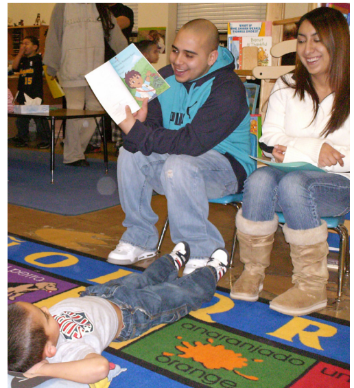
An event held with Head Start in February 2008.