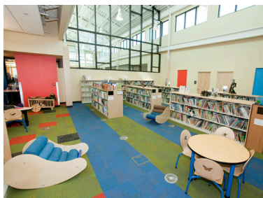
The new children's area at Pueblo West Library.

The Pueblo West Library opened its doors in 2009 and serves as a busy community center.