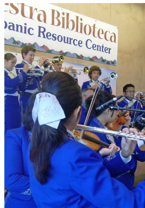
Mariachi Arcolris performs in September at Nuestra Biblioteca.