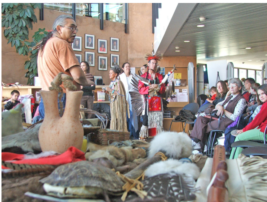
Pueblo Friendship Pow Wow Association presents to a group of more than 100 people in December 2008.