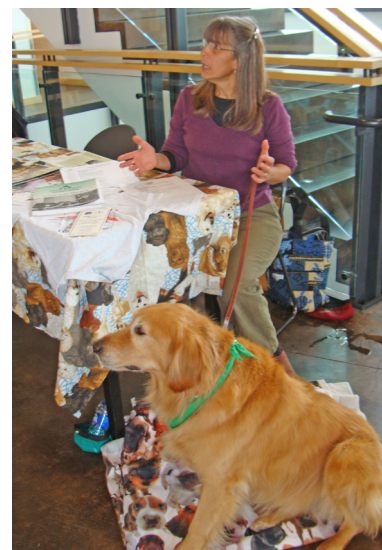
Therapy dogs were part of the Accessibility Awareness Day celebration in April 2008.

The Belmont neighborhood's Barkman Library had a 22 percent increase in checkouts.