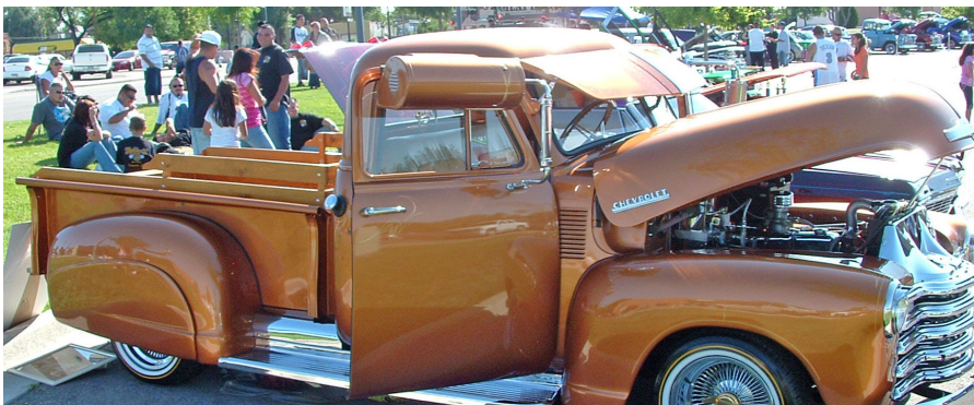
A 2008 Sweet Dreams Car Show entry at the library in September.