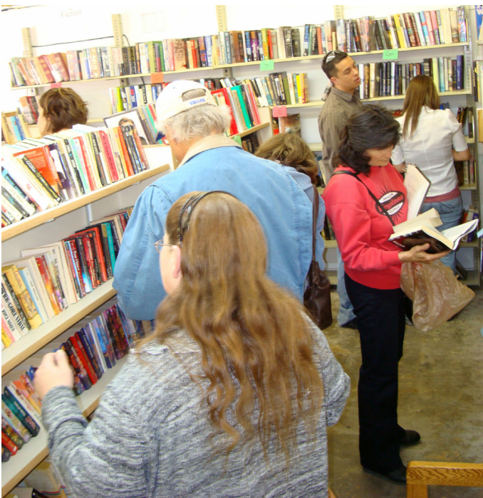
Friends of the Library's Side Door Sale in May 2008.