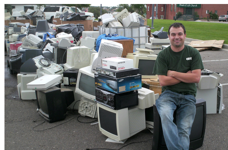
Hundreds of pounds of electronic waste was gathered at a library-sponsored recycling event in April 2008 at the Rawlings Library.