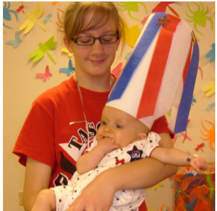
A young customer enjoys an arts and crafts event at Lamb Library.