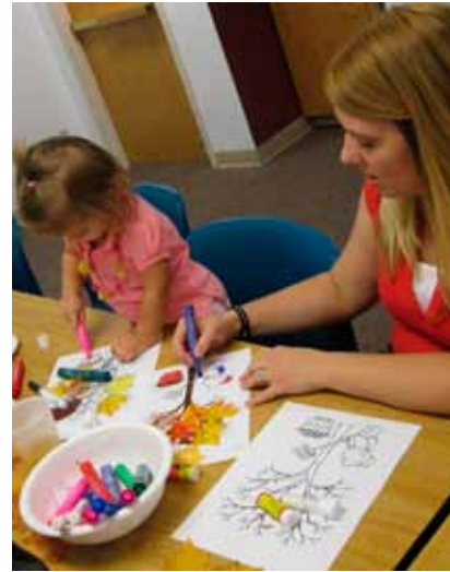
Mother and daughter enjoy the Leaves are Falling story time at the Lamb Library in September.