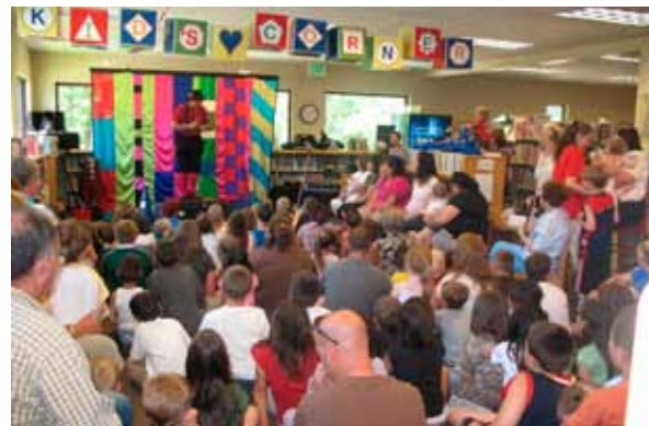
A summer reading club event at Barkman in June.