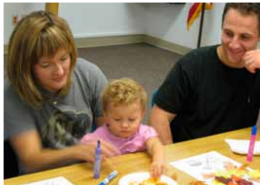
Thanks for bringing me to the library, mom and dad!