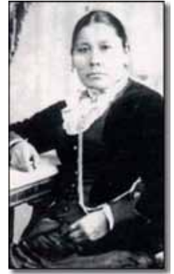
Amache Ochinee Prowers