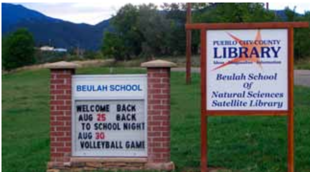
The satellite library at the Beulah School of Natural Sciences received a new sign in August.