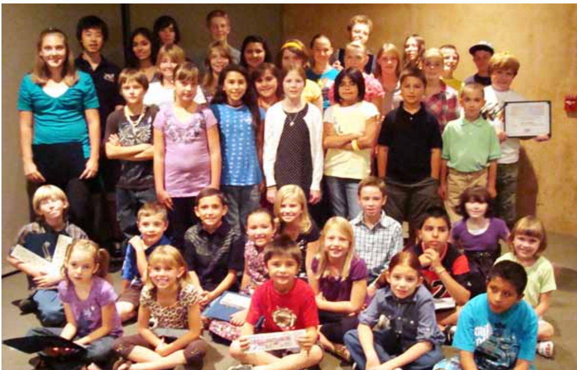
Bookmark Contest winners and honorable mention children pose for a photo at the Bookmark Contest Awards ceremony in September.