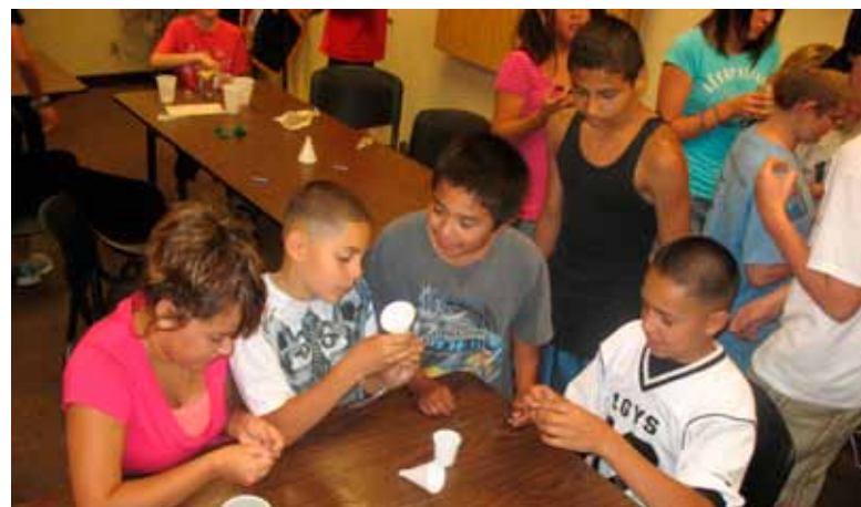
Wet and Wild craft at the Barkman Library in June.