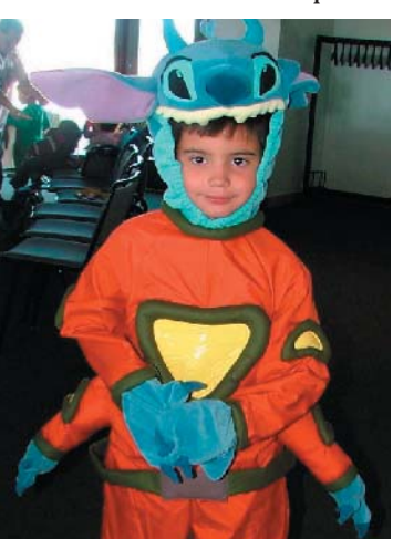
A colorful character strikes a pose.

celebrate our second birthday. See you in costume!