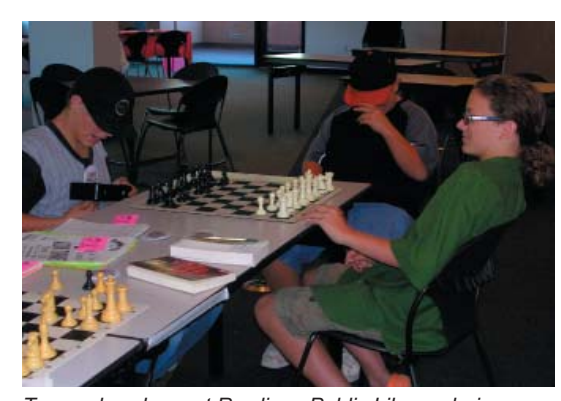
Teens play chess at Rawlings Public Library during a recent 1930s Play Day event.

These events are free and open to the public. Please call (719) 562-5660 for more information.