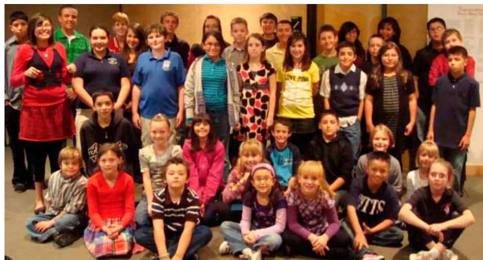
The winners of the 2010 Scary Story Writing Contest. More than 2,200 entries were submitted.