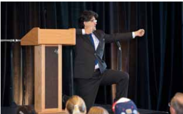
Author Sherman Alexie poses as an Indian action-figure.