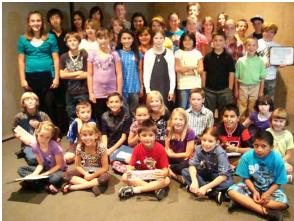
Bookmark Contest winners and honorable mention children pose for a group photo at the Bookmark Contest Awards in September.

Now our libraries face a great challenge. If the three initiatives on the ballot in this year's general election are passed, there will be changes affecting the way we carry out our mission. For while it is true that taxes will be reduced, there will also be significant reductions in library hours, the closing of some libraries, and staff layoffs. Please keep these things in mind when you go to the polls. Whatever the outcome, your Library staff and Trustees will continue to do our best to use the resources available to us to carry out our mission.