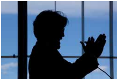
Sherman Alexie talks in detail about The Absolutely True Diary of a Part-Time Indian and entertains the crowd at the Rawlings Library.