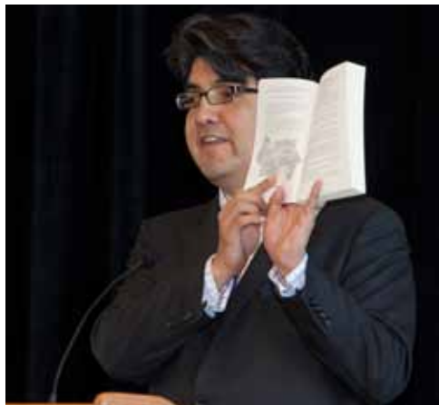
Sherman Alexie points out the "Shroud of Kentucky Fried" during his All Pueblo Reads event.