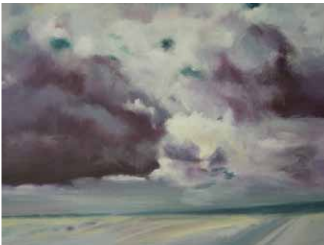
Clearing Sky by Lynn Stenzel

Artist Lynn Stenzel creates large landscape and skyscape paintings which capture the vast expanse of open plains heightened by the drama of an intense stormy sky. Acrylic paintings on canvas and original pastels on paper will be displayed. The images are dramatic, intense and yet serene.