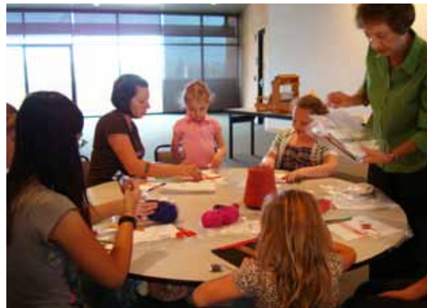
Children and adults enjoy learning to weave at the All Pueblo Reads Kids Weaving Workshop in October.