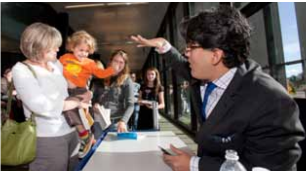
Sherman Alexie "fist bumps" a young fan during his book signing at the Rawlings Library.