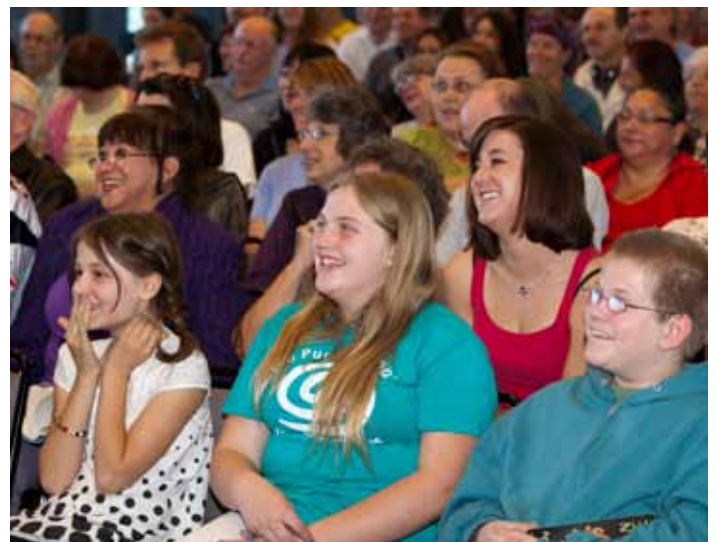
The Pueblo School for Arts and Sciences Book Club sat in the front row during All Pueblo Reads author Sherman Alexie's event on Oct. 24.

Enjoy a variety of Japanese food, games, and activities. Have some manga you want to trade? Bring it to the library and find something new to read! Whether new to anime/manga or an old pro, come prepared to have fun and experience something new and exciting about anime. Konnichiwa , Pueblo!