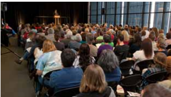
Nearly 400 fans from all over Colorado gather to hear 2010 All Pueblo Reads author Sherman Alexie.