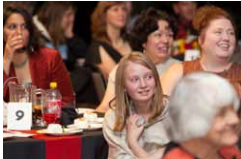
Sherman Alexie keeps the Booklovers' Blacktie Ball crowd smiling all night.