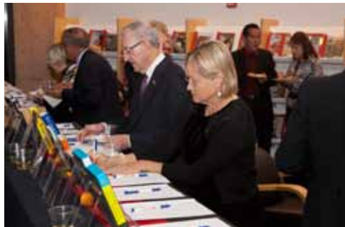
Guests bid on autographed books during the Booklovers' Blacktie Ball to raise money for the library.