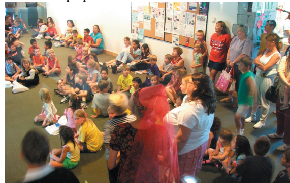
Children listen to a program at Rawlings Library.