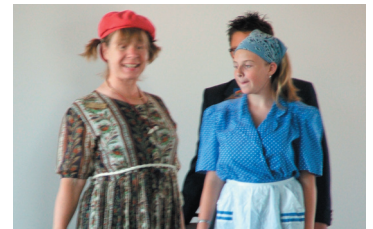
Performers act out a skit.