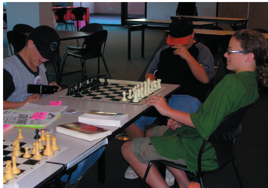
Teens play chess at Rawlings Public Library during a recent 1930s Play Day event.

These events are free and open to the public. Please call (719) 562-5660 for more information.