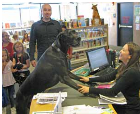
Hamlet takes a break from his training demonstration to ask for books during the Read OUT LOUD! Kickoff in February.