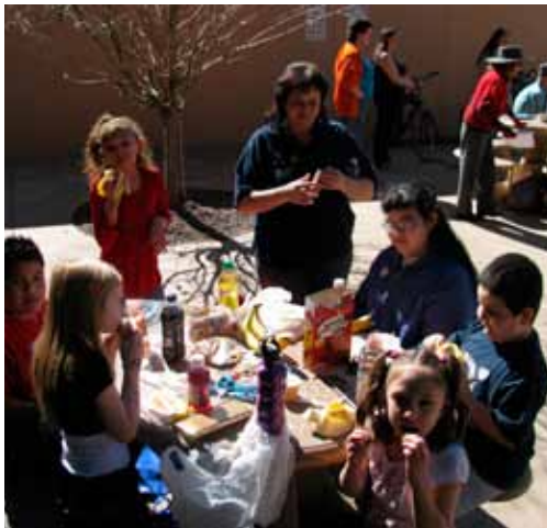
Kids have fun in the Rawlings Library courtyard during the Read OUT LOUD! Kickoff in February.