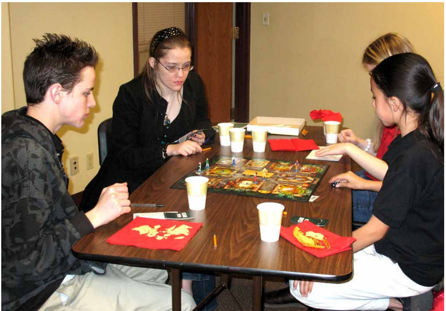
Teens enjoying Games Galore, a Teen Scene event in February at Barkman Library.