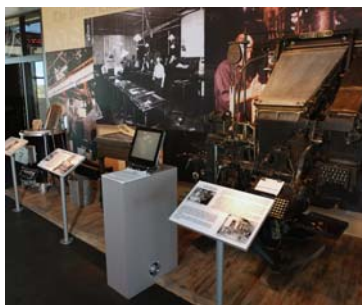
Part of the items on display at the InfoZone News Museum.

To showcase our wonderful community, the Library District's InfoZone