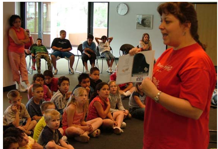
Children listen to a presenter at the Rawlings Library.