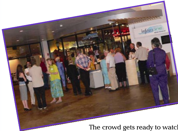
The crowd gets ready to watch the premiere of the new Celebrate Pueblo! films.

Abriendo Inn Buell Children's Museum EconoLodge El Pueblo Museum Hampton Inn HARP Impossible Players & the Southern Colorado Theatre Company KCSJ/KDZA-Clear Channel Radio La Renaissance Pueblo City Parks & Recreation Dept. Rocky Mountain Coors Rosario's