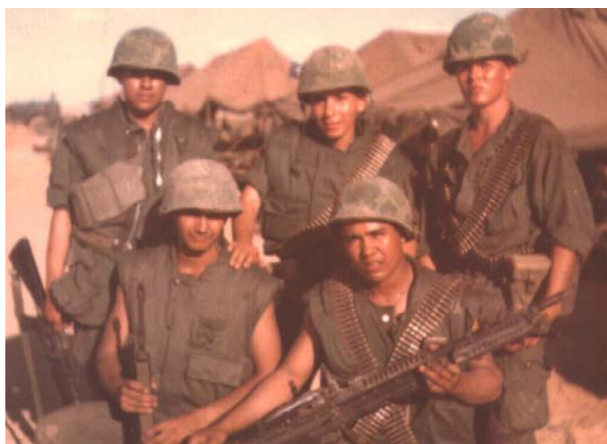
Hispanic veterans in Vietnam.

The film includes America's Hispanic Medal of Honor recipients and stories about local Hispanic veterans.