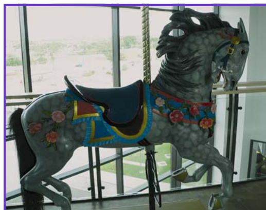
Lead Horse from the City Park Carousel

InfoZone News Museum patrons can now take home their favorite part of Pueblo. All the new Celebrate Pueblo! theme films are available on DVD at the InfoZone gift shop, located at the front desk of the museum on the fourth floor of the Rawlings Public Library. Anyone who's ever called Pueblo home, or even just visited, will love this InfoZone film series. The cost per Celebrate Pueblo! DVD is $15. Don't delay - pick up your copy today! They won't last long!