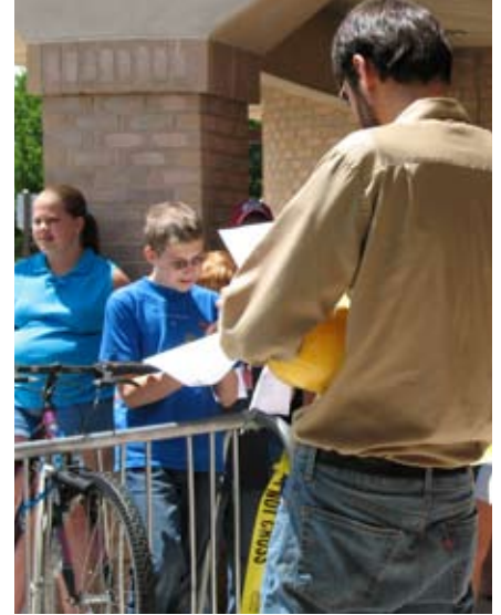
Teen Summer Reading Club "Murder by the Slice" program at Barkman Branch Library.