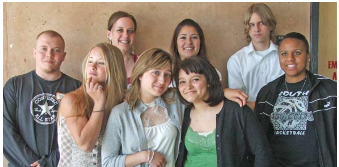
High school students participate in the first ever Authors Institute, sponsored by the Southern Colorado Writing Project and the Pueblo City-County Library District. The students spent a week at the library working on their writing skills.