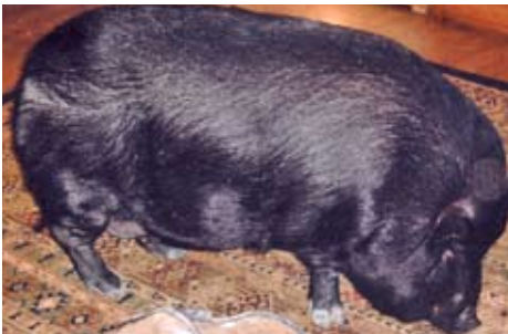
Wilbur the pig.

Wilbur Hambone Stevens, pig Tuesday, July 3 at noon Minnequa Park at Bessemer