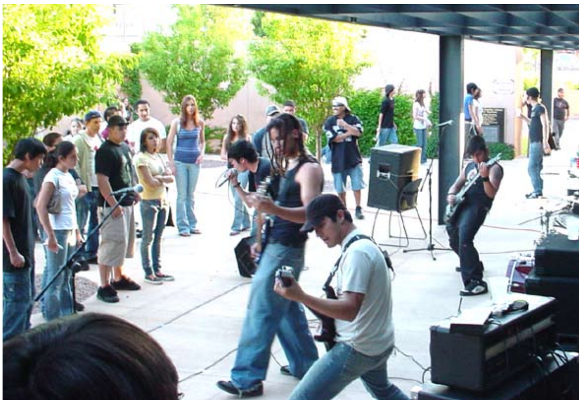
Screamo Concert held after hours in the outdoor courtyard of the Rawlings Public Library in June.