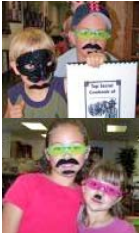
Having fun with disguises at the Beulah School Satellite Library.

This summer, have fun going to programs at nine Pueblo City-County Library District satellite library locations: Avondale Elementary, Beulah School, Craver Middle School, Cesar Chavez Academy, North Mesa Elementary, Risley Middle School, Rye Elementary, South Mesa Elementary and Vineland Elementary. Some of the special programming includes silhouetting, braille and sign language.