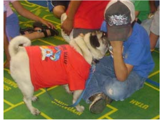
Otis greets a fan at the Avondale Satellite Library.

Call 562-5631 for times of service in your neighborhood!