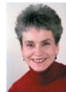
Meet author Frances Moore Lappé

Writing an Effective Genealogy Letter, Exercises for the Genealogist, Bessemer Historical Society Records as Genealogy Source, and Internet Searching are just a few program titles. Call (719) 562-5626 to register or for more information.