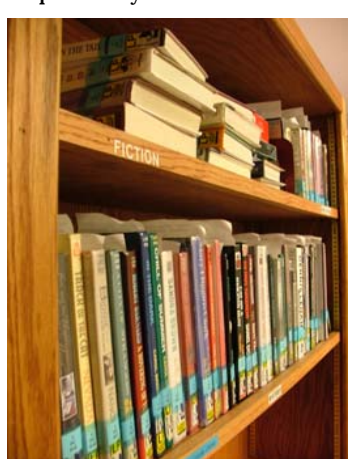
Large-print books line the shelves at the Regent Satellite Library.

A wonderful feature of all Satellite Libraries is that any material from any Pueblo City-County Library may be requested and will be transported to any satellite location specified by the patron. This saves a trip for anyone who's