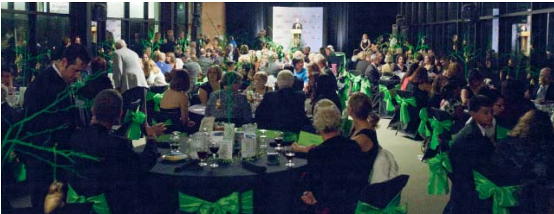
Library supporters raised funds for the Pueblo Library Foundation at the Booklovers Blacktie Ball with Carl Hiaasen.