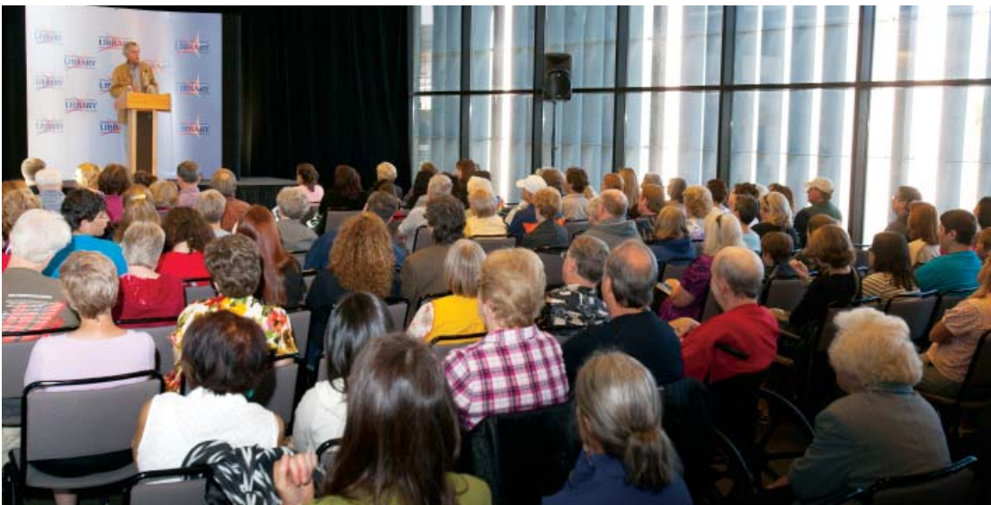
Hundreds of fans from all over Colorado gather to hear 2011 All Pueblo Reads author Carl Hiaasen.