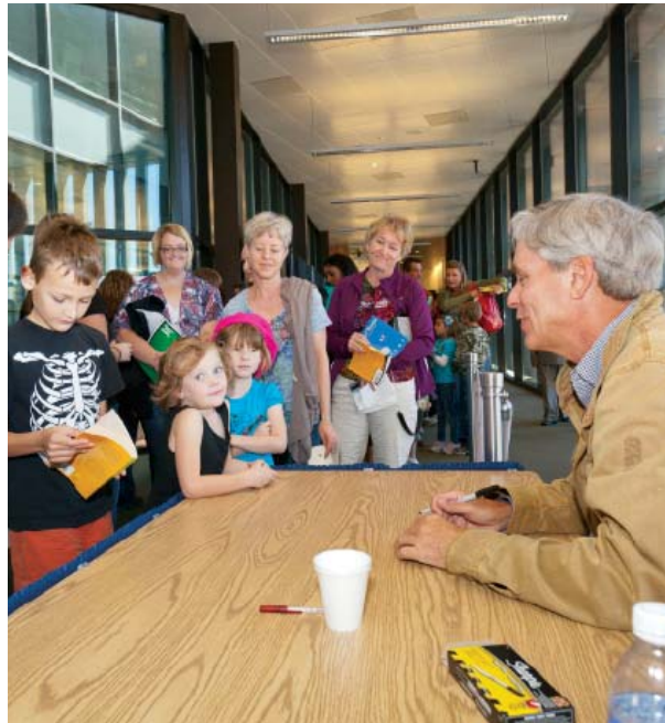
Fans of all ages came to meet author Carl Hiaasen.