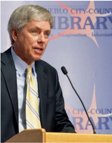
Author Carl Hiaasen at the Booklovers Blacktie Ball to celebrate the library's 2011 All Pueblo Reads project featuring Hoot.