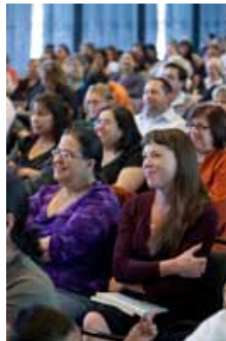
The fantastic crowd!