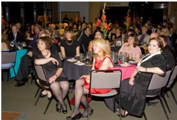
Guests listen to Sandra Cisneros read new stories from an upcoming book. Author Sandra Cisneros.