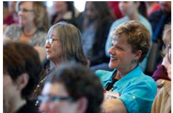
Members of the audience smile while listening to Cisneros.