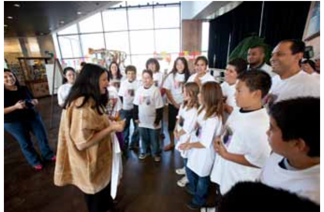
Students from Risley Middle School meet with Sandra Cisneros.