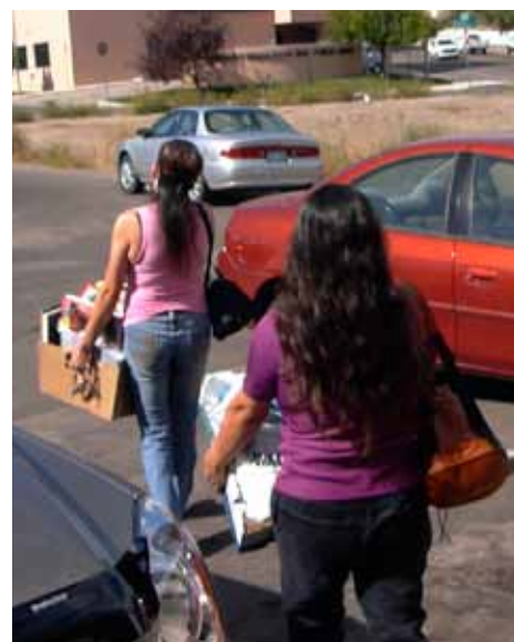
Customers carry out books by the boxful!