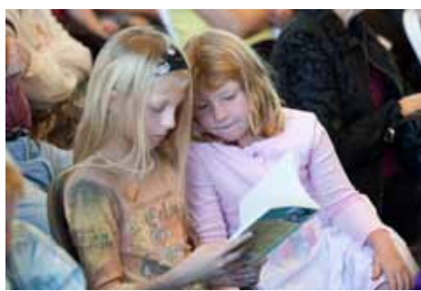
Two young fans check out Mango Street.