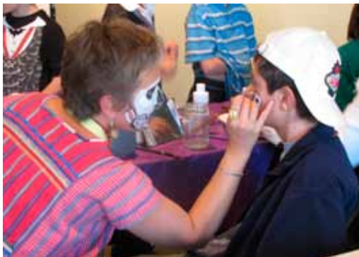
Face painting at the Rawlings Library.