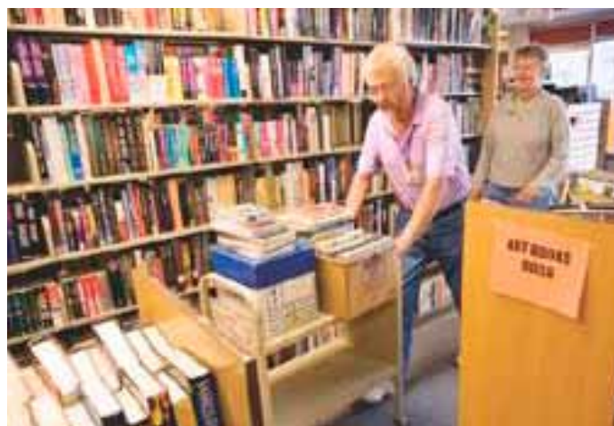
Volunteers cart books around Books Again.