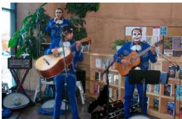
Mariachi music creates a festive Dia de los Muertos atmosphere.