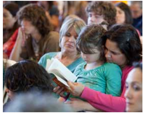
Three generations of fans read along with Cisneros.