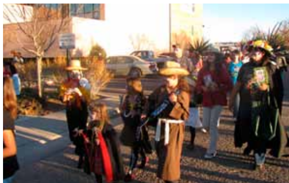
The procession starts from the Rawlings Library.