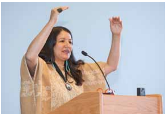
The very animated speaker and author, Sandra Cisneros.