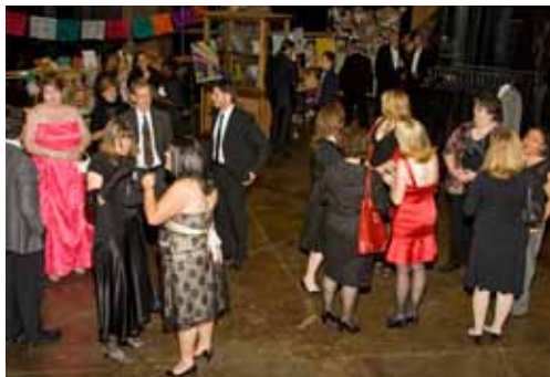
The crowd mingles before dinner.