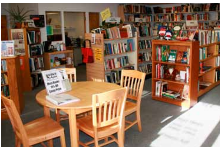
The beautiful space kept up by the volunteers: Books Again Bookstore.