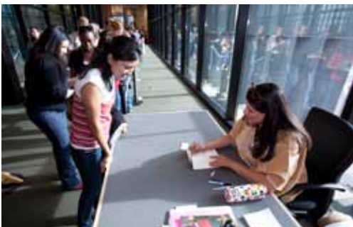
Cisneros signs a book for a teenage fan.