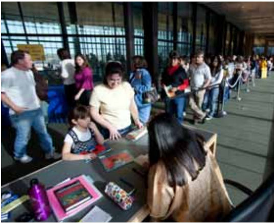
Sandra Cisneros signed hundreds of books for fans.