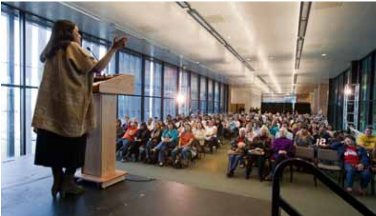
Sandra Cisneros entertains a crowd of more than 400 in November.