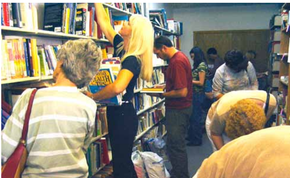
Customers look for treasures at the Books Again/Friends of the Library sale in October.