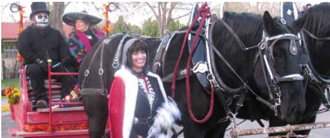
A horse-drawn carriage was part of the Dia de los Muertos festivities held at Pueblo Community College in October.