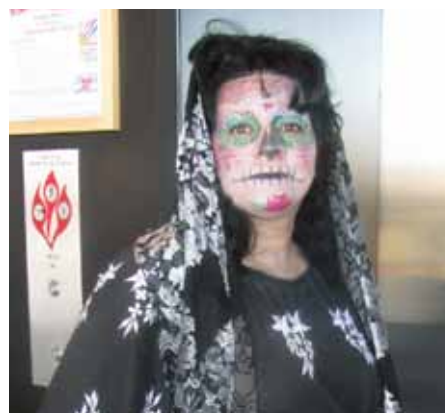
A woman celebrates Dia de los Muertos.