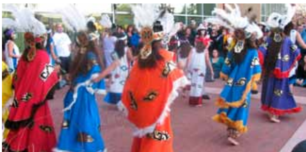
The festivities continue at El Pueblo Museum.