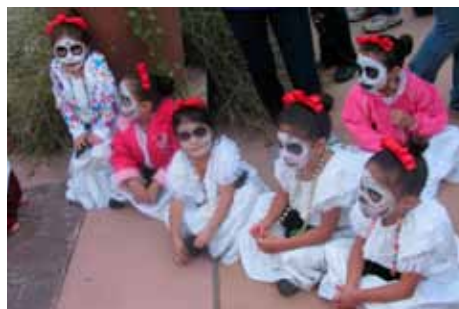
Girls get into the spirit of Dia de los Muertos.